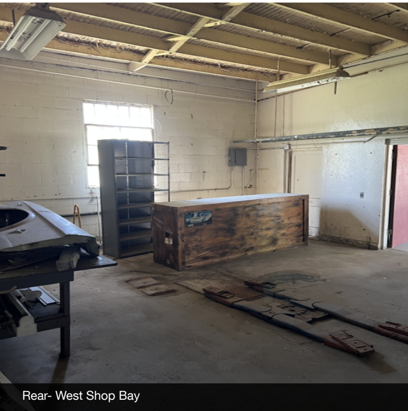
Rear- West Shop Bay