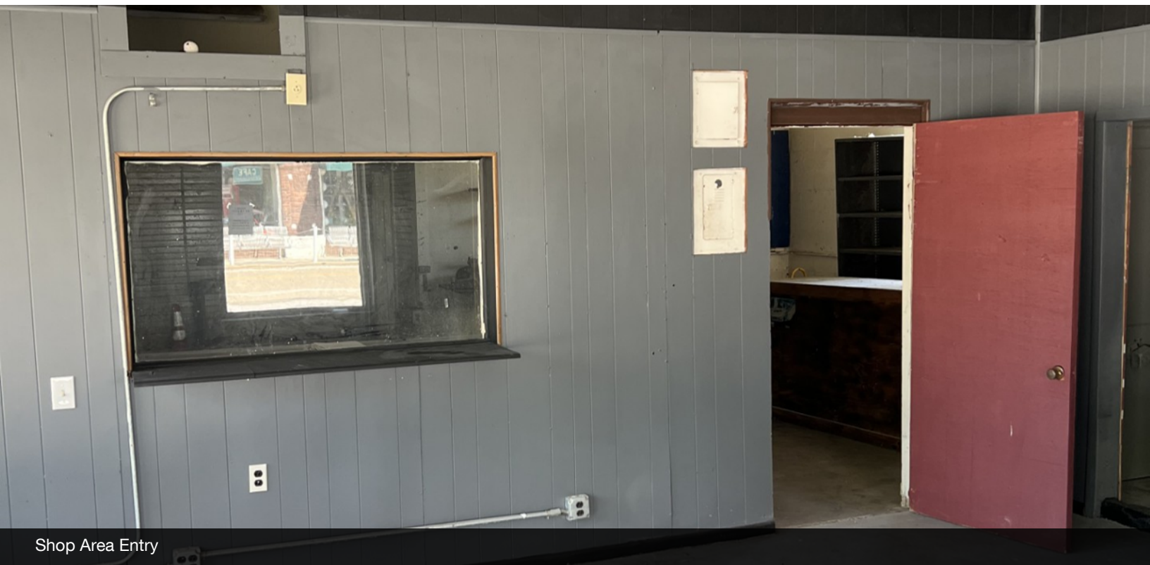
Shop Area Entry