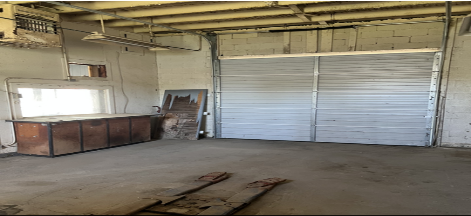
Front- West Shop Bay