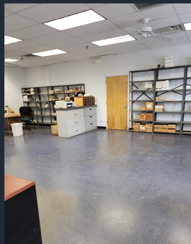
Main Space Office