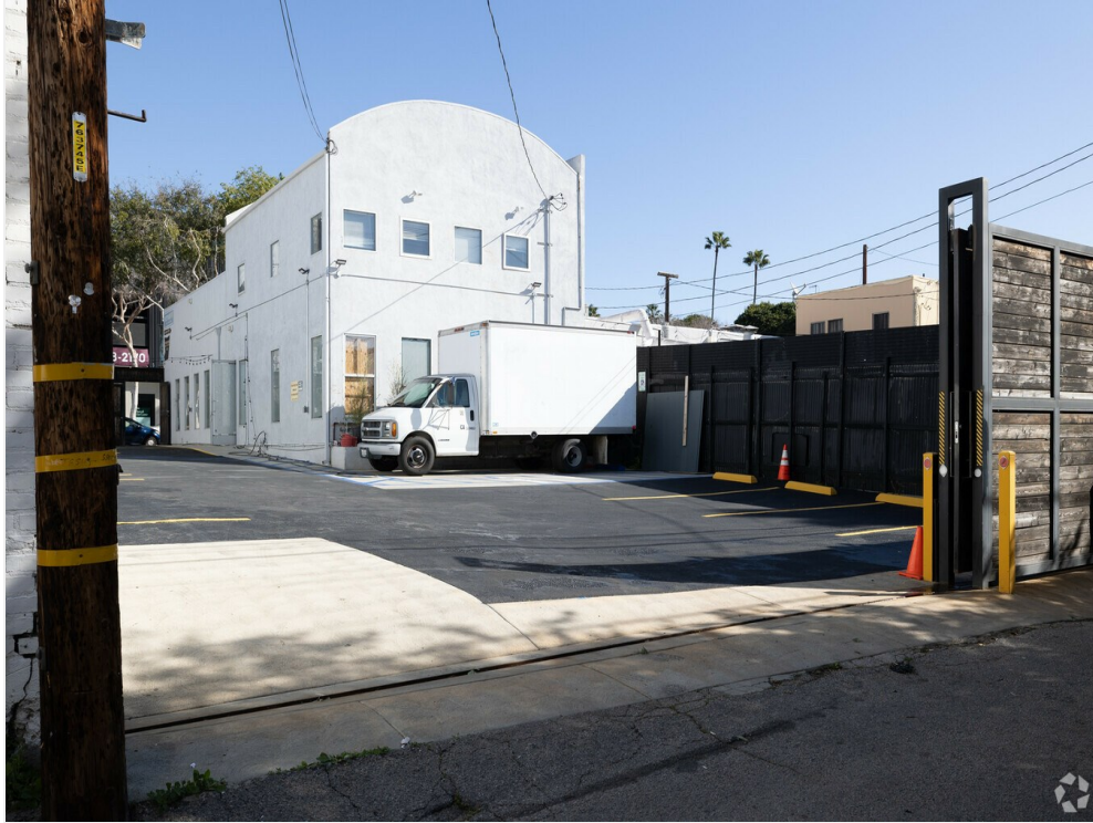
Parking Lot Entrance