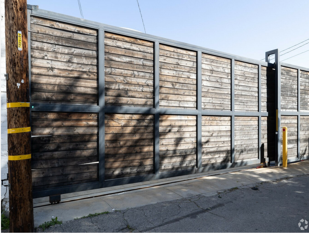
Parking Lot Entrance