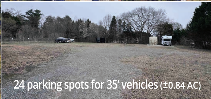
24 parking spots for 35' vehicles (±0.84 AC)