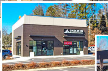
Evergreen Veterinary Hospital