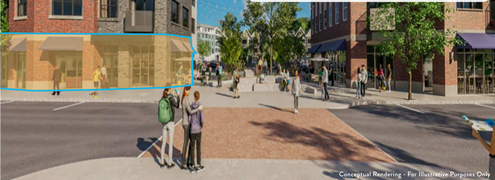
Conceptual Rendering - For Illustrative Purposes Only

The available commercial space consists of approximately 3,294± SF and is ideal for retail, office, restaurant, or fitness uses. It will be located at street level between Buildings C and D, overlooking the Cochecho River and the new city park.