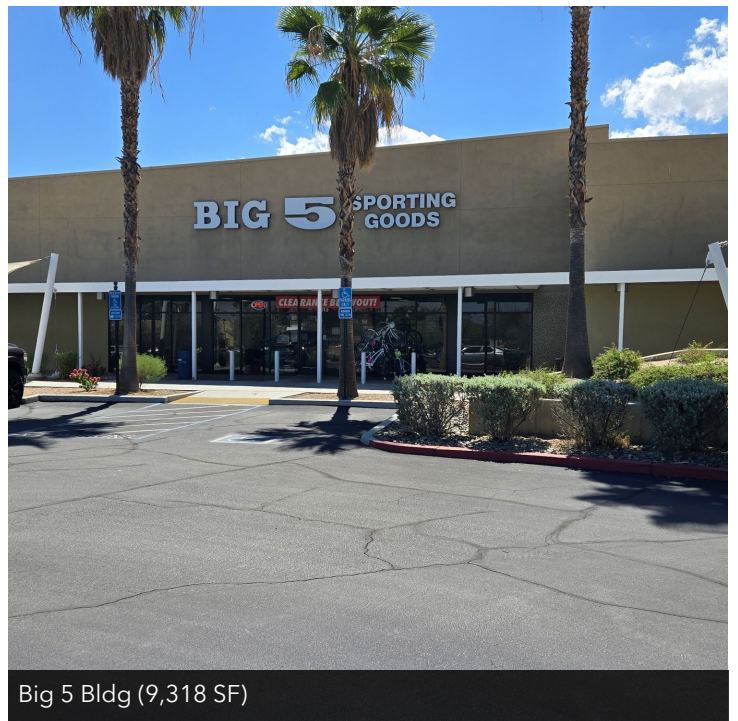
Big 5 Bldg (9,318 SF)