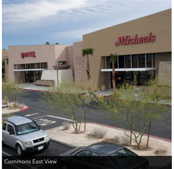
Commons East View