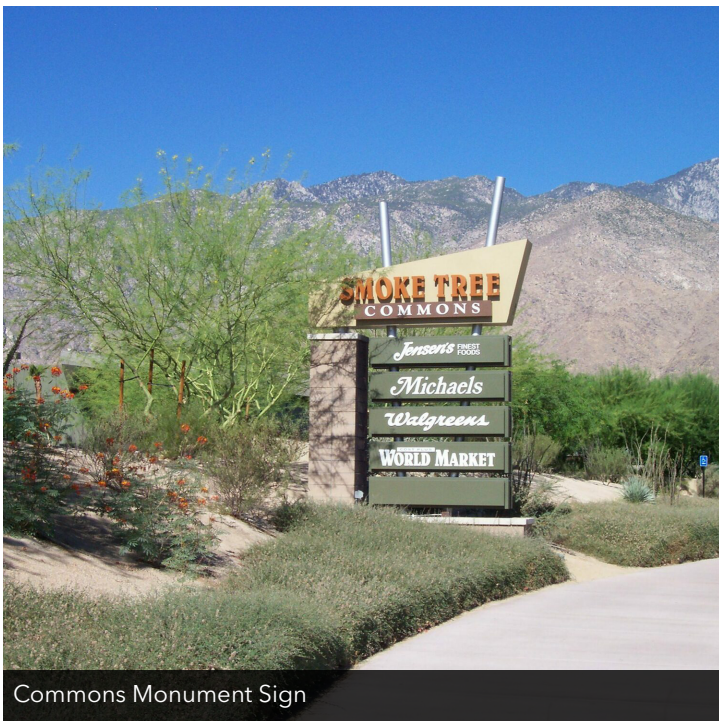
Commons Monument Sign