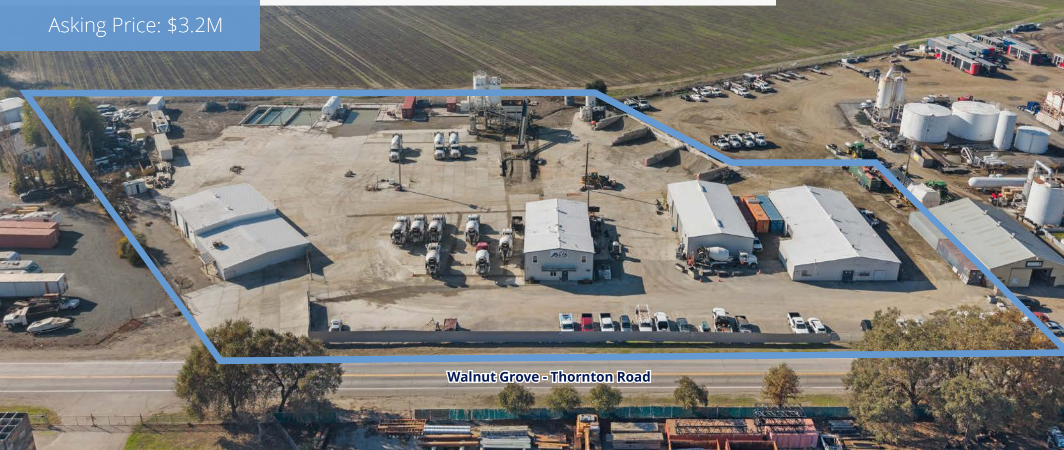
Walnut Grove - Thornton Road