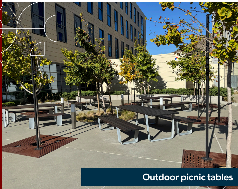
Outdoor picnic tables