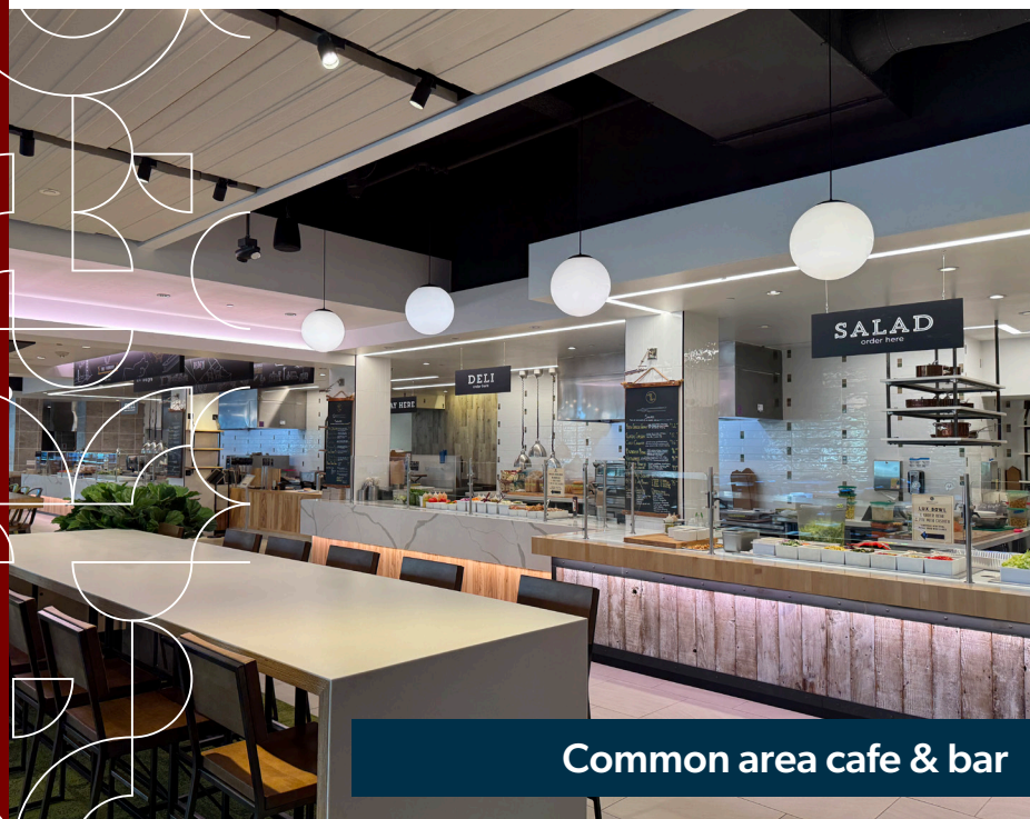
Common area cafe & bar