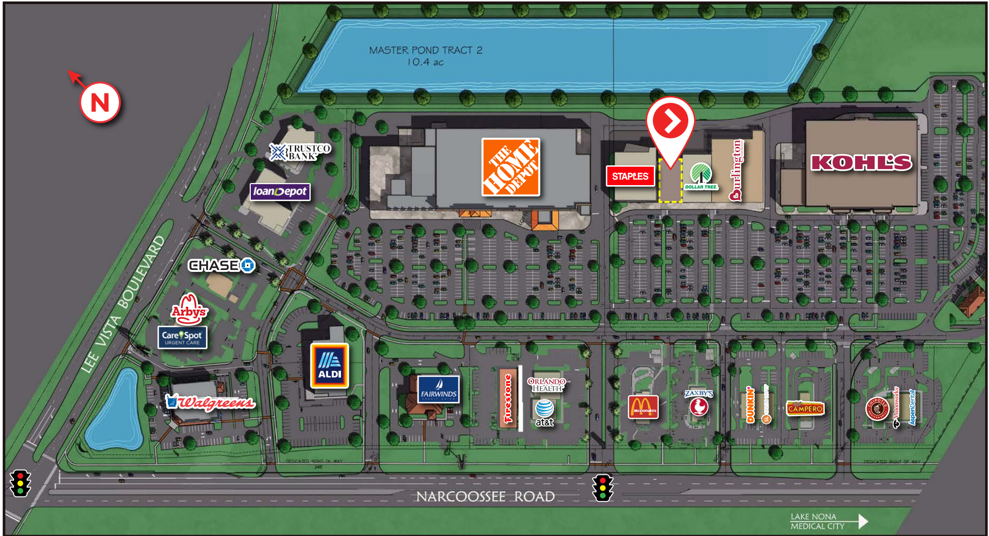
VISTA PALMS SHOPPING CENTER