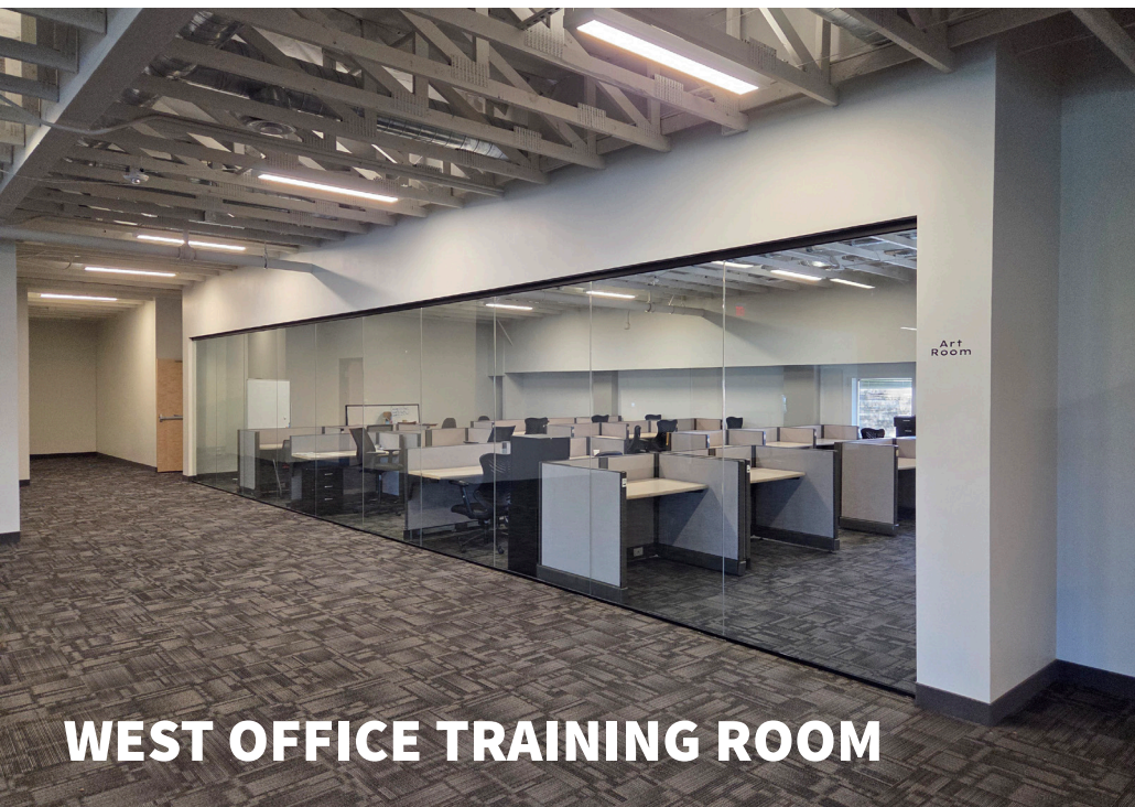
WEST OFFICE TRAINING ROOM