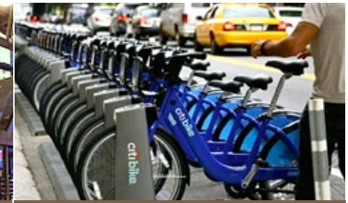
CitiBike Stations Nearby