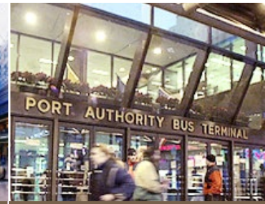
Port Authority Bus Terminal