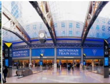
Moynihan Train Hall