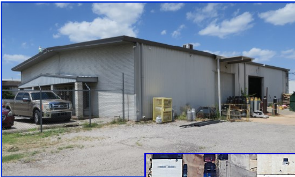
5,000-Sq.Ft. Building Located in Popular Santa Fe Industrial District