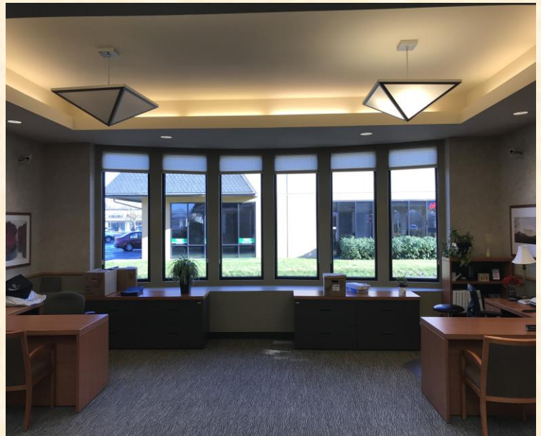
LOBBY & CUSTOMER AREA

INTERIOR & EXTERIOR IN EXCELLENT CONDITION. INCLUDES A/C, FULLY FURNISHED KITCHEN, BANK VAULT, AND DRIVE-THROUGH LANES WITH TELLER COMMUNICATIONS. ORIGINAL CONSTRUCTION COMPLETED IN 2005.