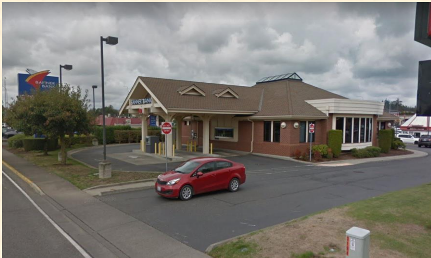
VIEW AT DRIVE FROM KOK ROAD

Former Bank Branch and Office located at Lynden Towne Plaza in Lynden, Washington.