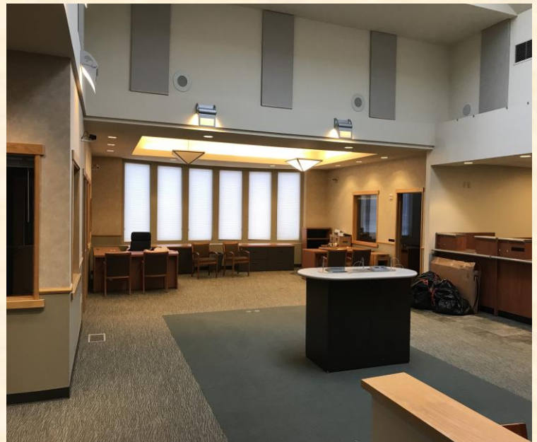
INTERIOR CUSTOMER AREA

PROPERTY SUBJECT TO LONG TERM GROUND LEASE. SELLER IS OFFERING TO SUBLET PREMISES AS-IS OR SELL IMPROVEMENTS TO NEW USER. CONTACT BROKER FOR DETAILS.