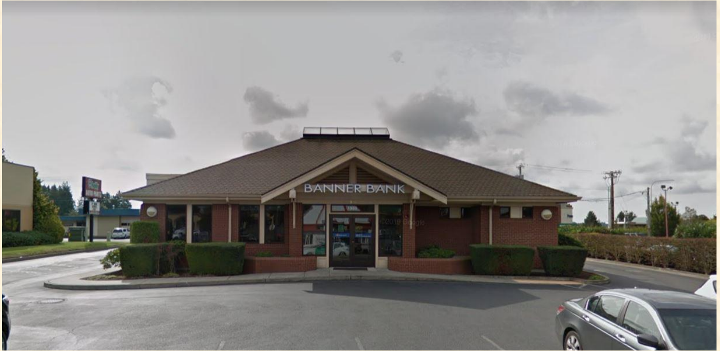
FRONT VIEW FROM PARKING AREA, INCLUDING BRICK VENEER EXTERIOR

LOCATED ADJACENT TO DAIRY QUEEN, MCDONALD'S, AND O'REILLY AUTO PARTS AT LYNDEN TOWNE PLAZA. EXCELLENT SITE LAYOUT & BUILDING FEATURES. INCLUDES DRIVE THROUGH AND ONSITE PARKING.