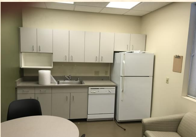
KITCHEN AT STAFF BREAK ROOM