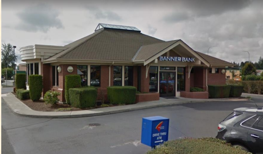
VIEW OF BUILDING MAIN ENTRY AREA