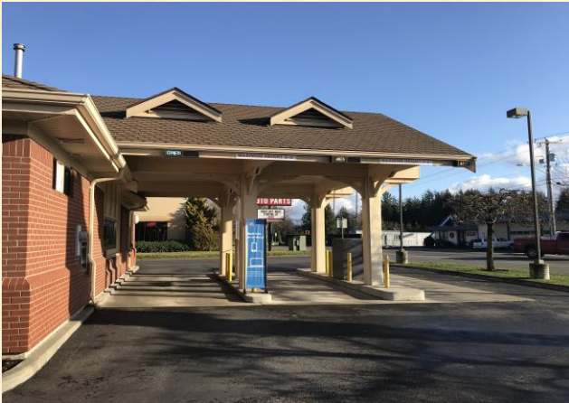
DRIVE-THROUGH LANES & WINDOW