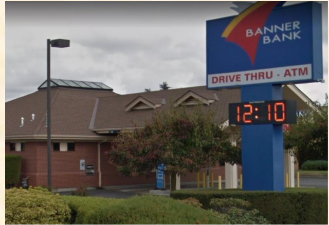
EXTERIOR VIEW WITH KOK ROAD SIGNAGE SHOWN