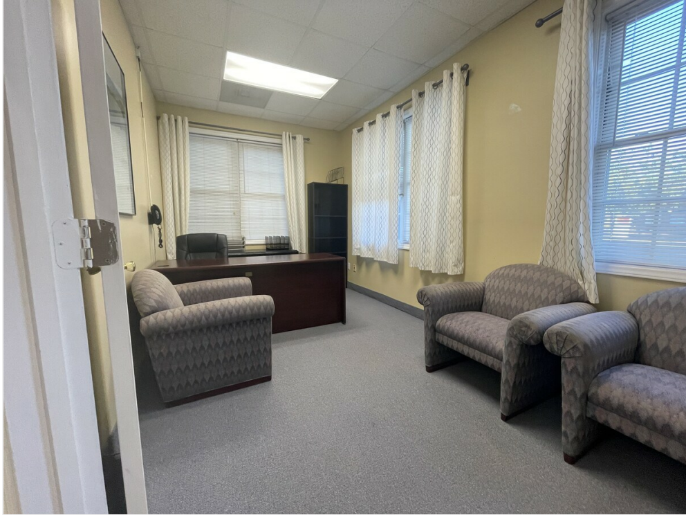
100B office 4