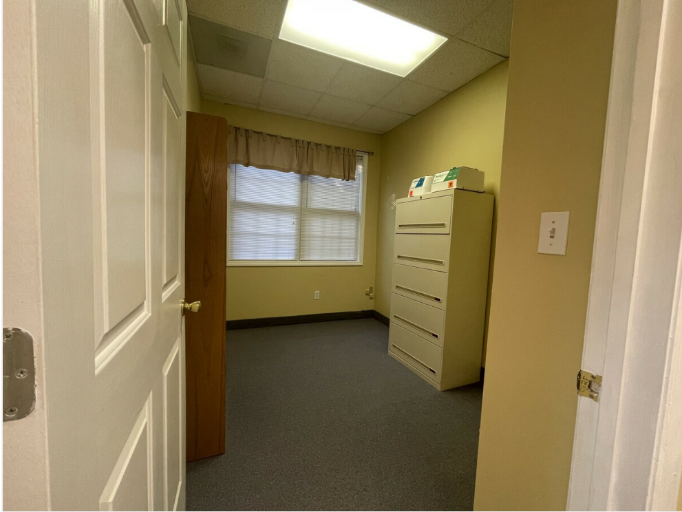
100B office 3