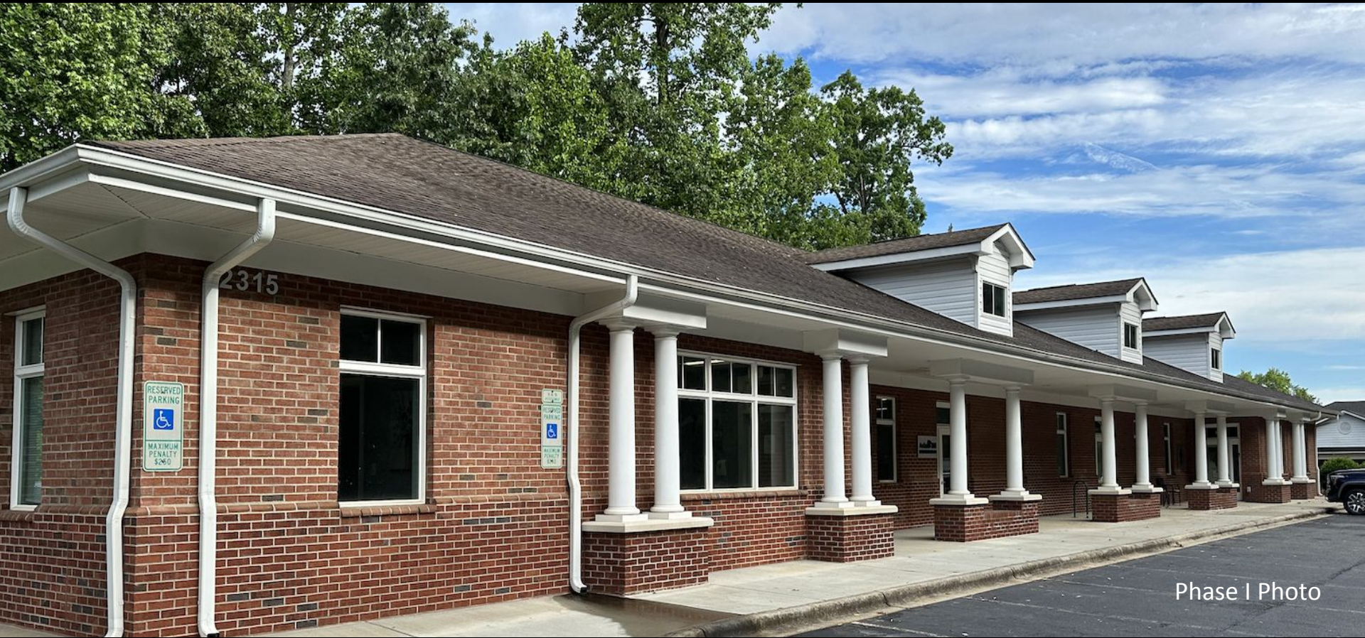
Phase I Photo