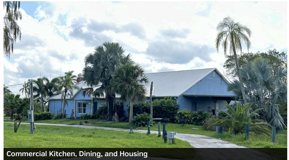
Commercial Kitchen, Dining, and Housing