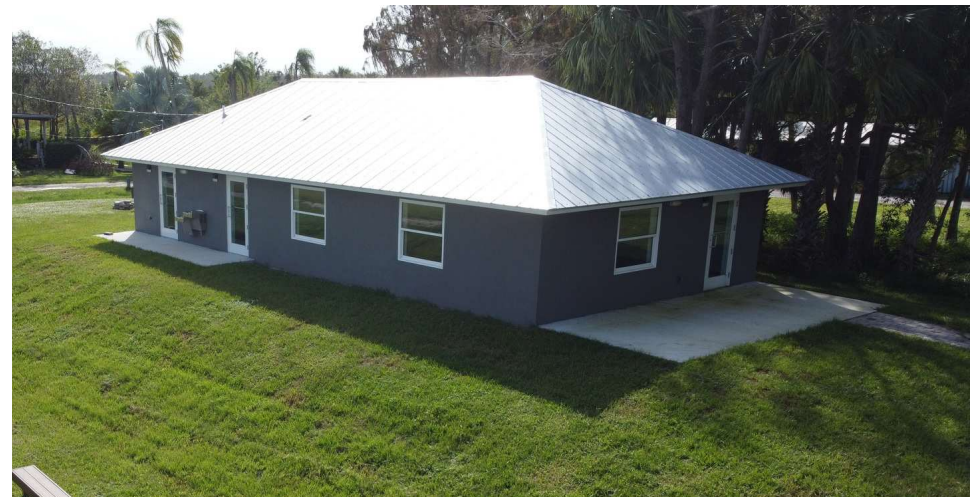
Laundry Facility and Gym