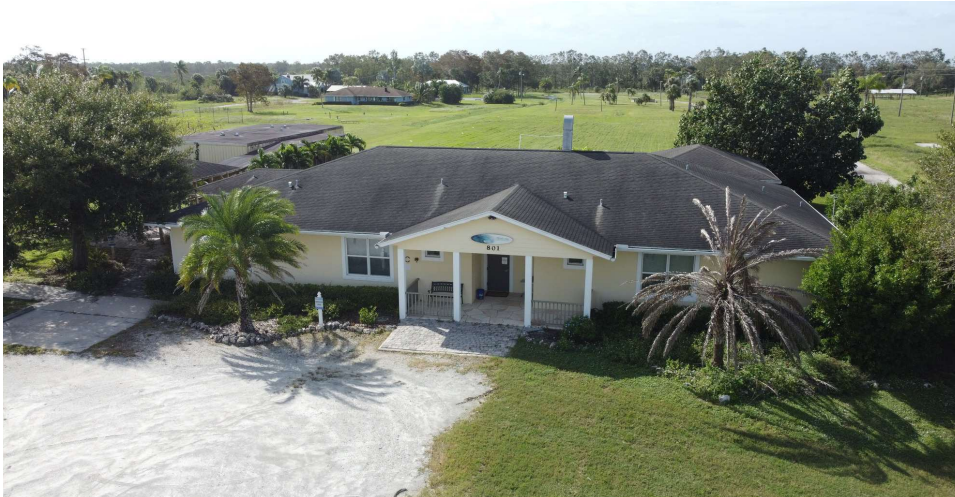
Main Administration Building