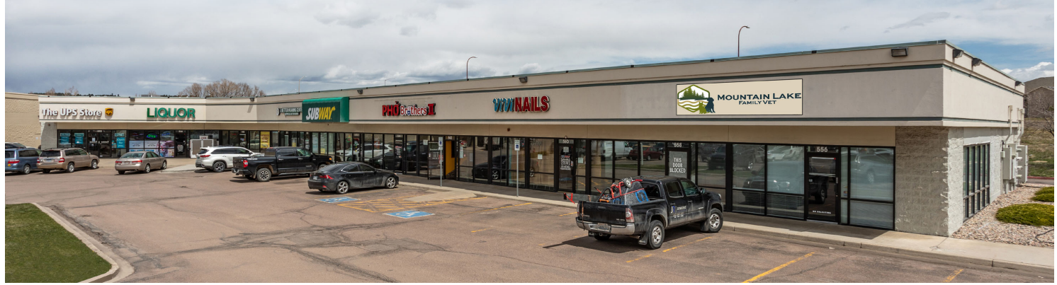
modified photo-imaging | Copyright © 2024 J. Barry Winter | All Rights Reserved

556-590 West Highway 105, Monument, Colorado 80132