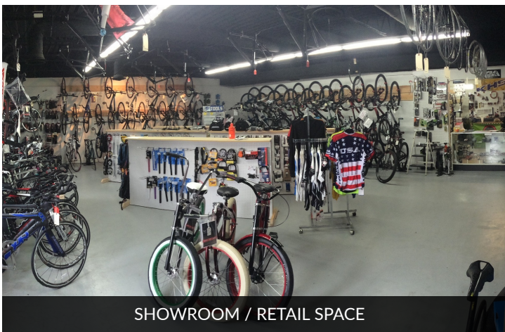
SHOWROOM / RETAIL SPACE