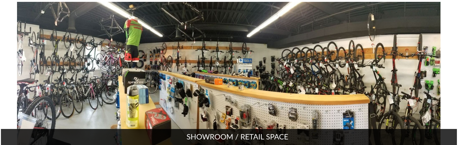
SHOWROOM / RETAIL SPACE