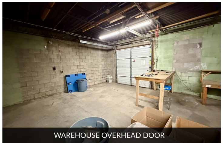
WAREHOUSE OVERHEAD DOOR

JOHNNY STRADAL 405.990.0569 johnny@creekcre.com