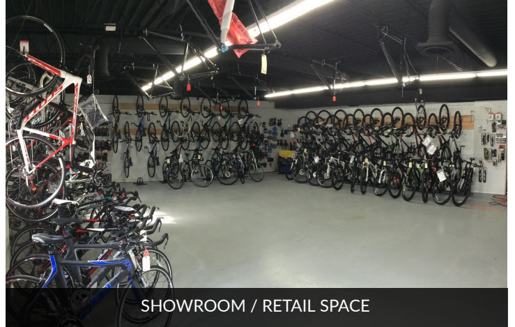
SHOWROOM / RETAIL SPACE