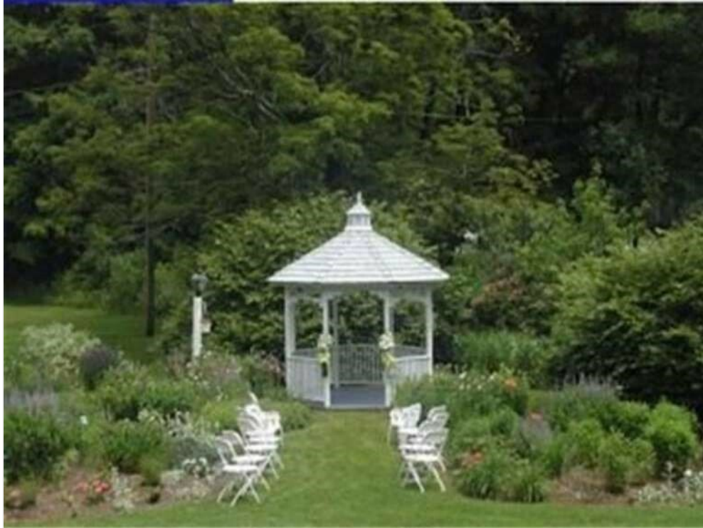
1896 House Wedding Gazebo