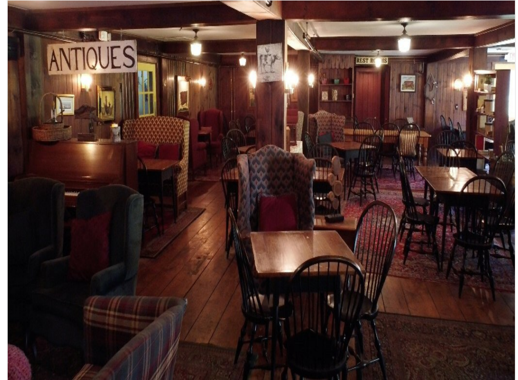
Dining Room 1896 House