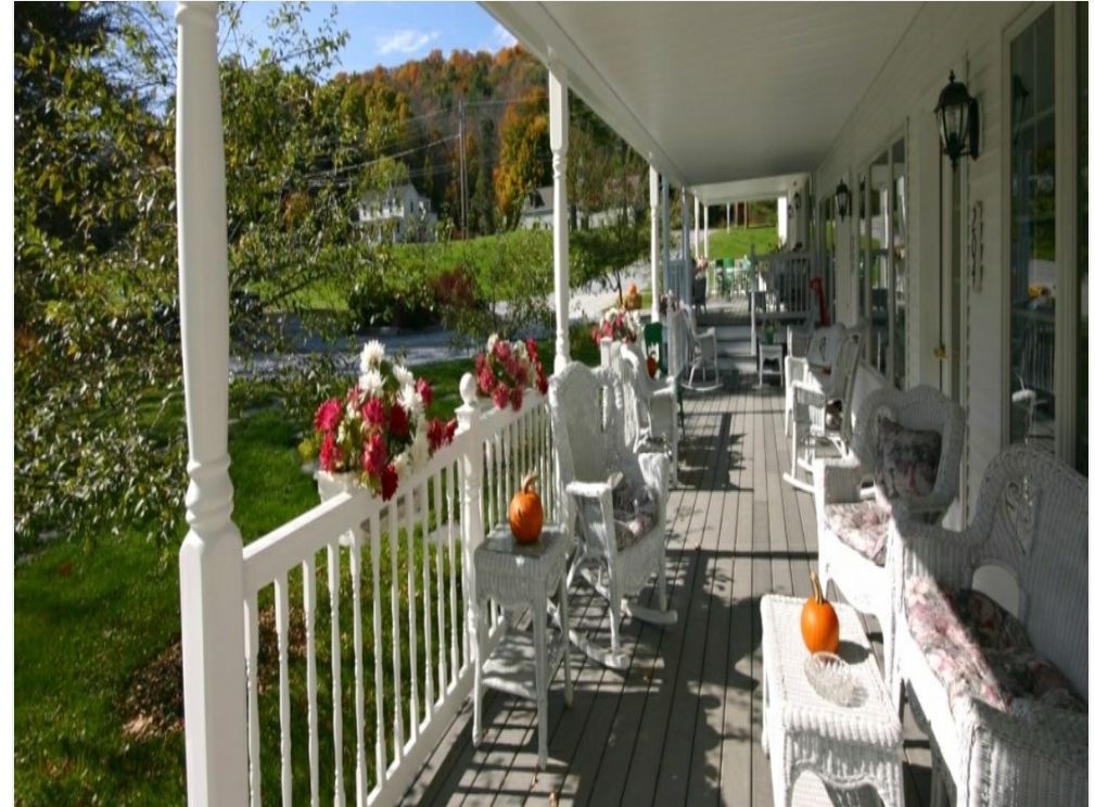
Veranda Barnside Suites