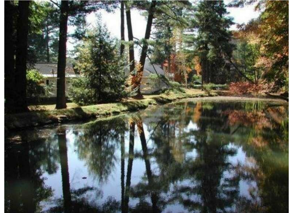
1896 House Grounds