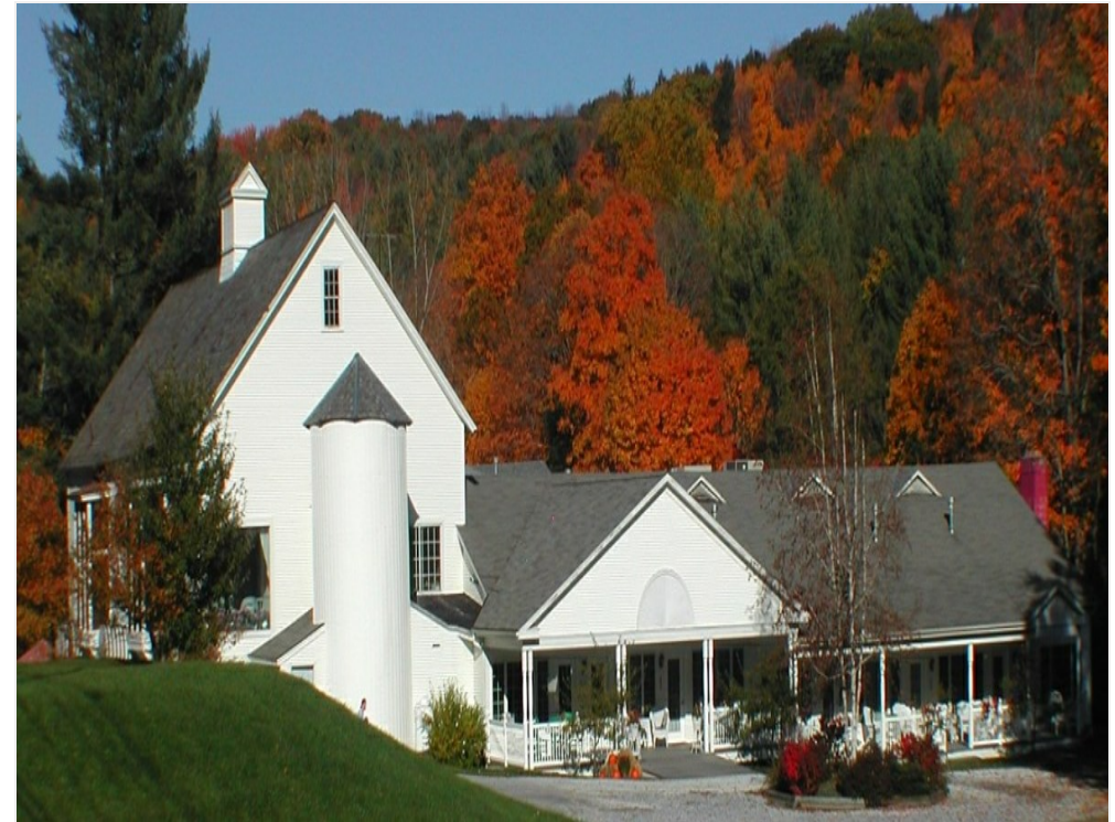
Barnside 1896 House