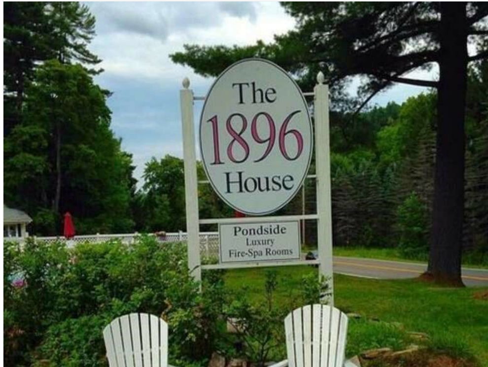
1896 House Sign Pondside