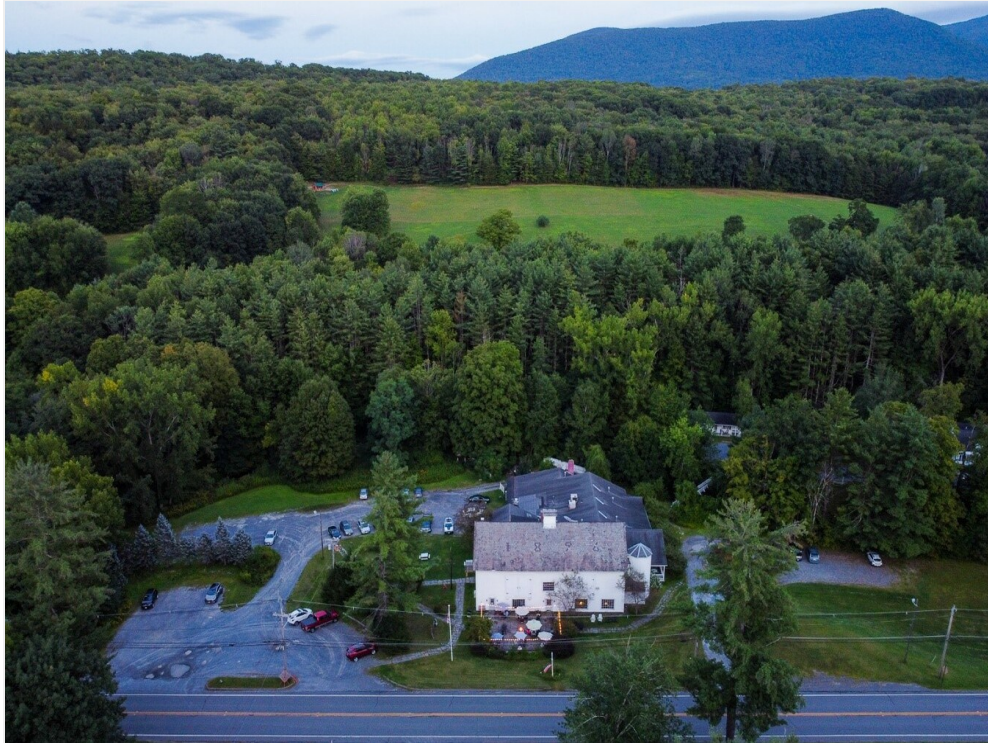
Aerial of 1896 House