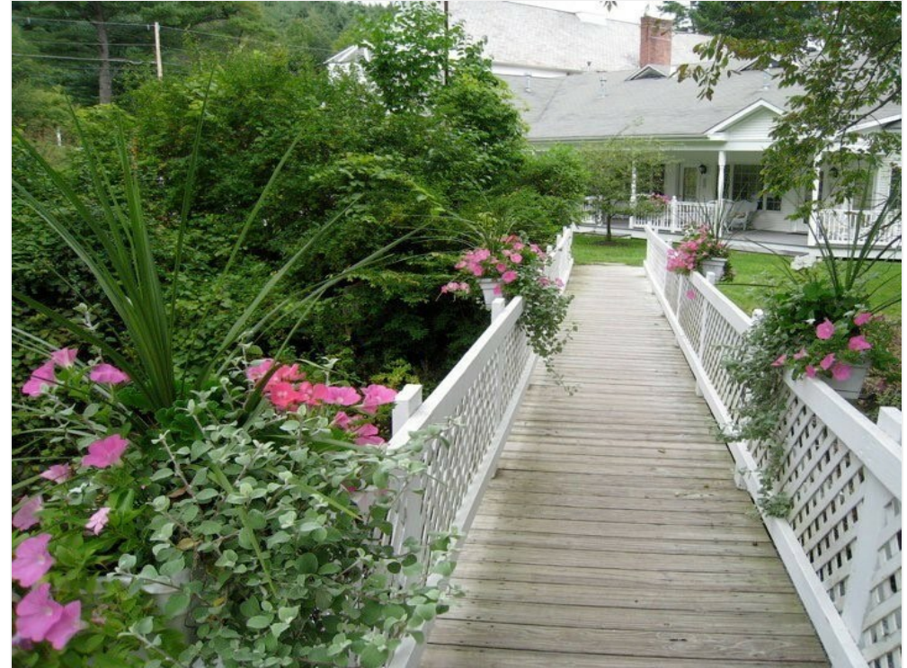
Picturesque Walkway 1896 House