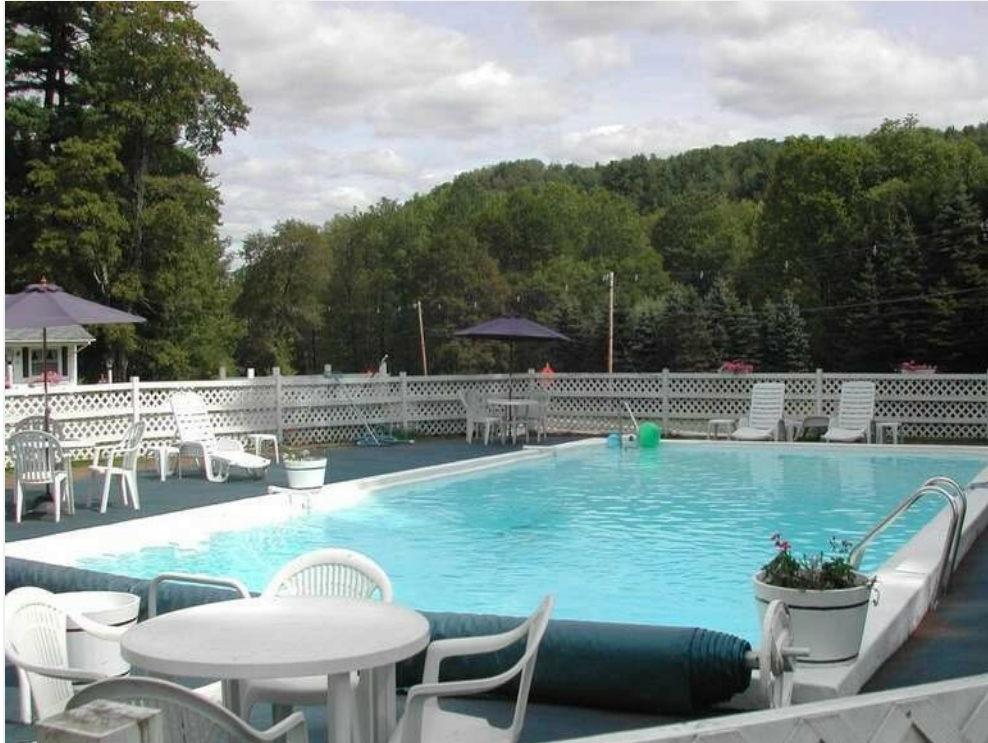
1896 House Swimming Pool