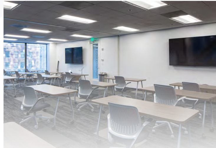
Large, Collaborative Training Room