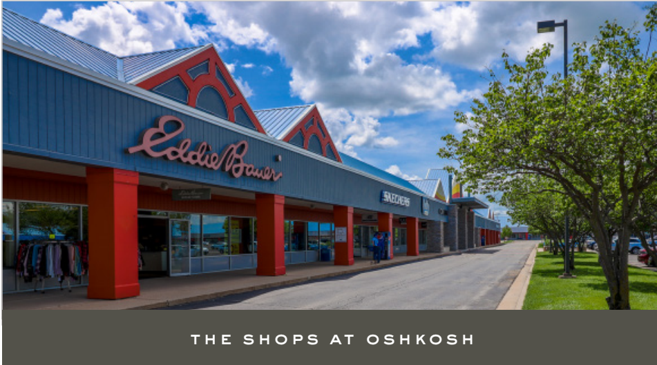
THE SHOPS AT OSHKOSH