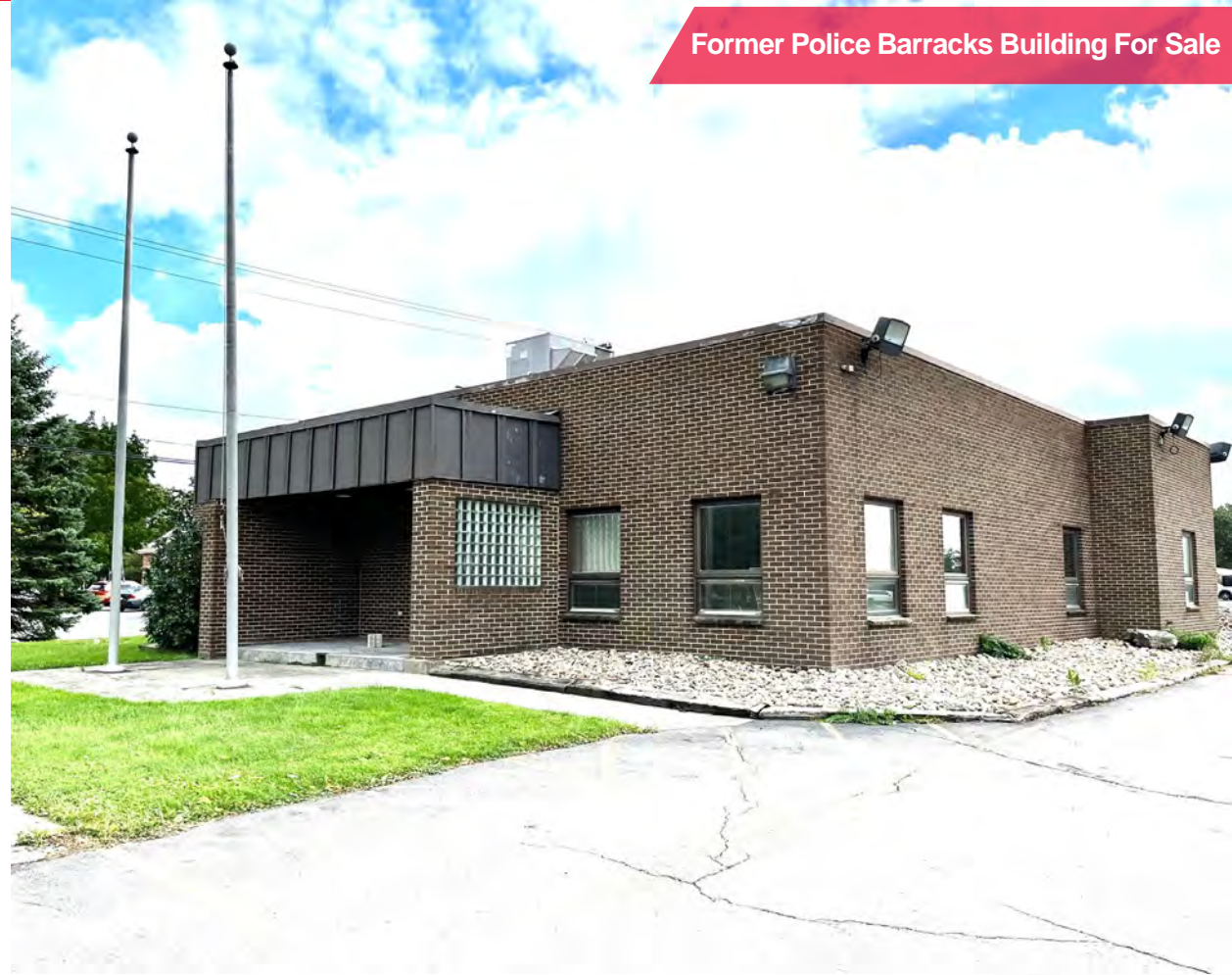
Former Police Barracks Building For Sale