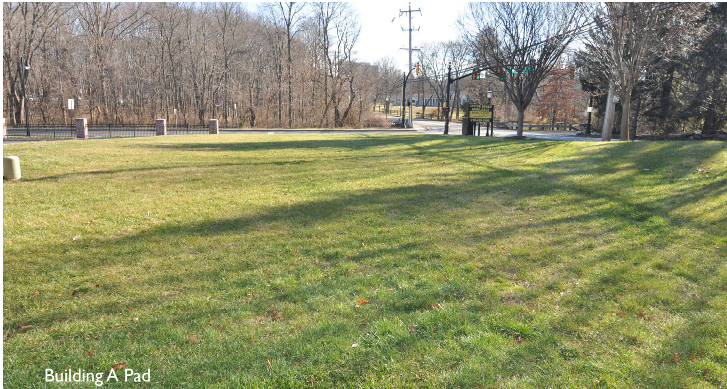
Building A Pad

Tax Parcel: ..... 08-017-004-00A Zoning: ..... C Water & Sewer: ..... Public Total Tax Assessment: ..... $22,320 Total Annual Tax (2021): ..... $3,736 Pad Purchase Price: ..... TBD