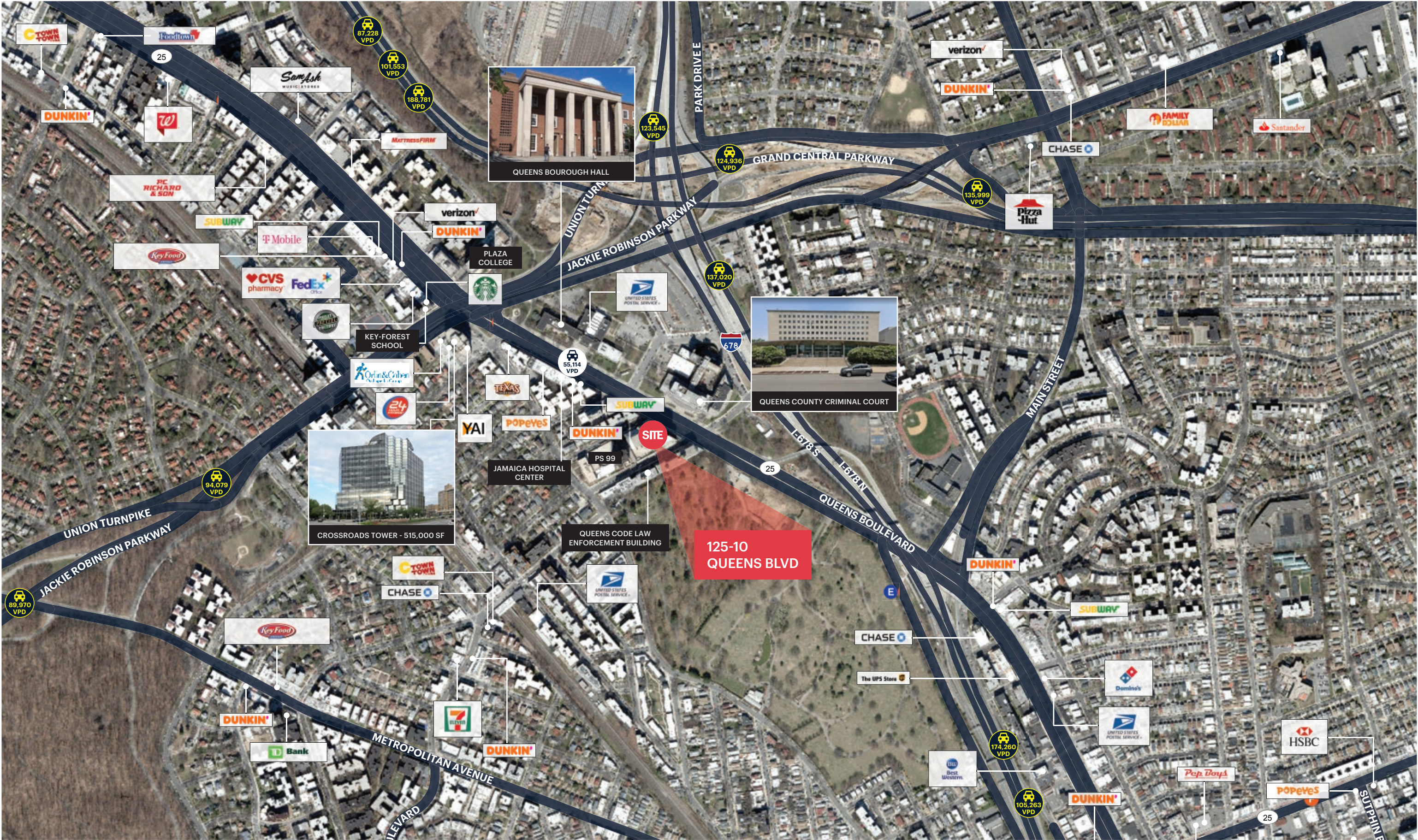
125-10 QUEENS BOULEVARD KEW GARDENS, NY