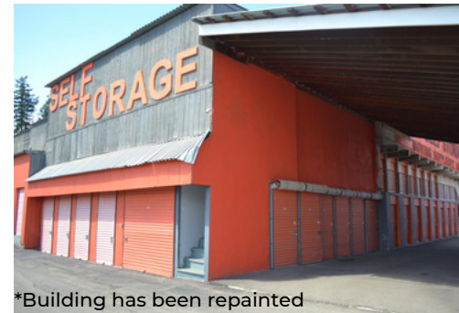
*Building has been repainted