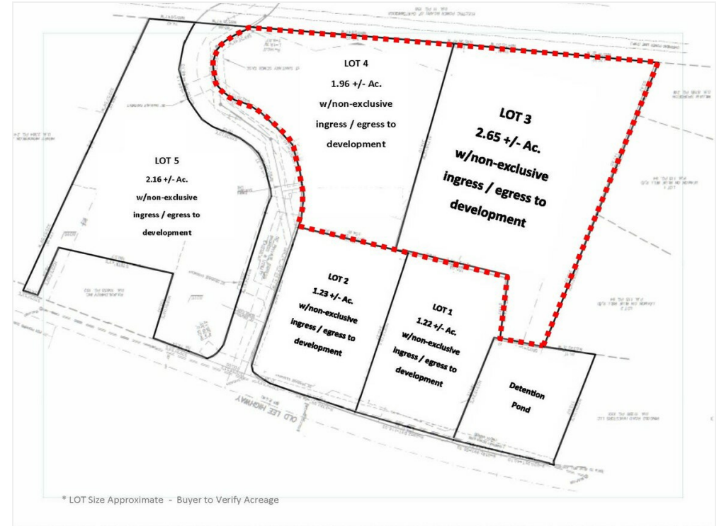
Old Lee Hwy Development - LOT 3 & 4