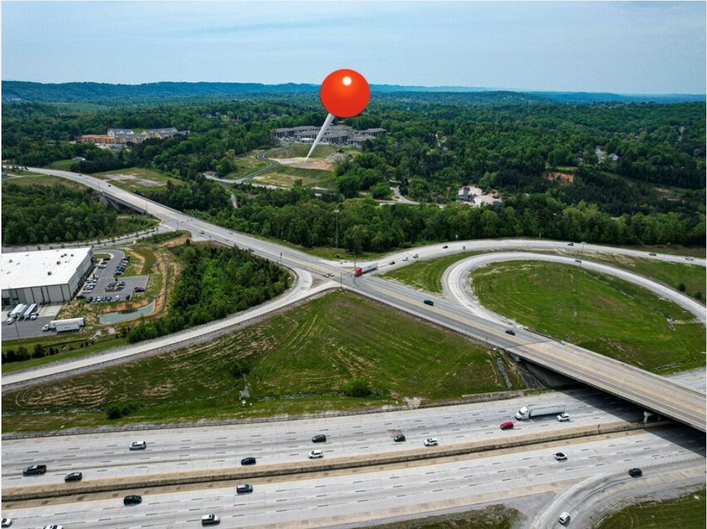
LOT 3 & 4 _ view from Interstate 75