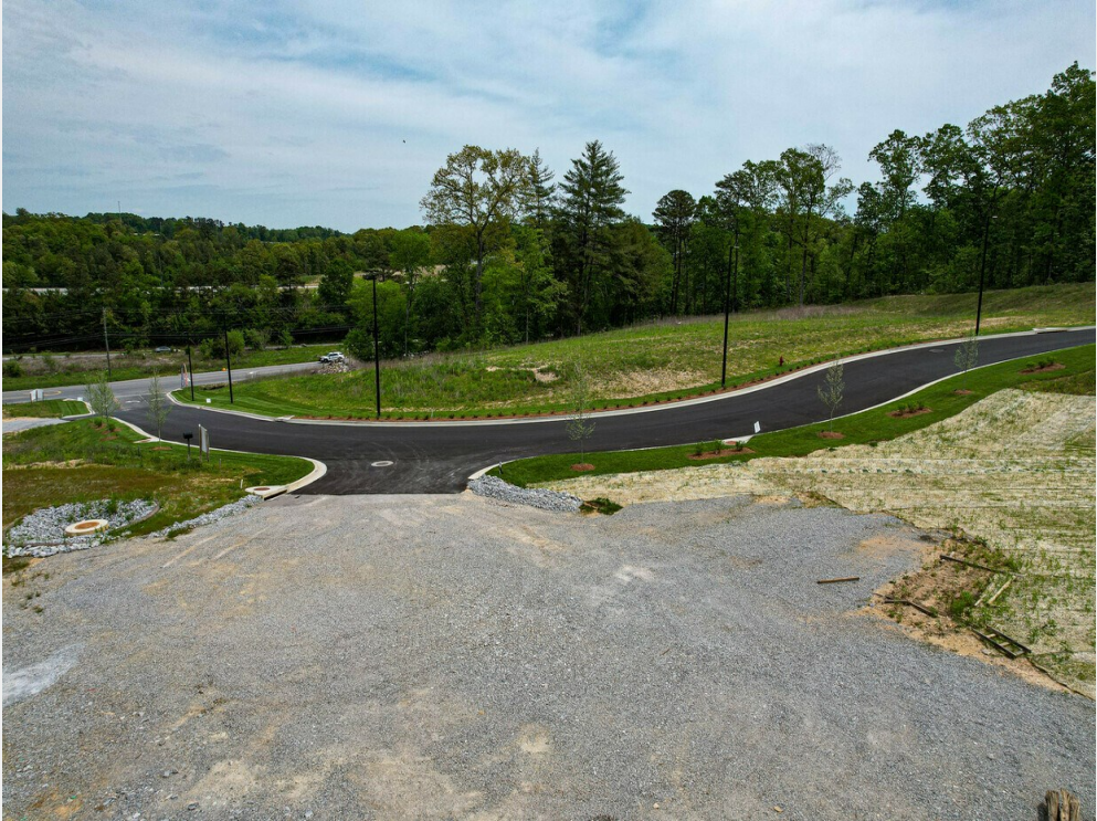
Lot 3 & 4 - Curb Cut_pic 2