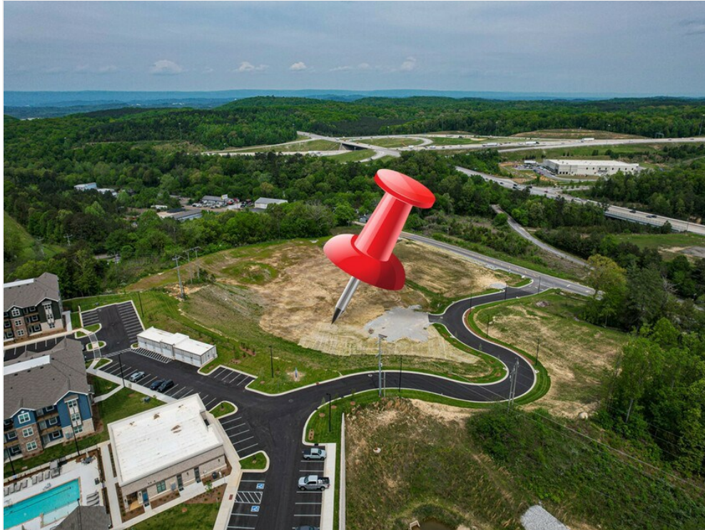
LOT 3 & 4