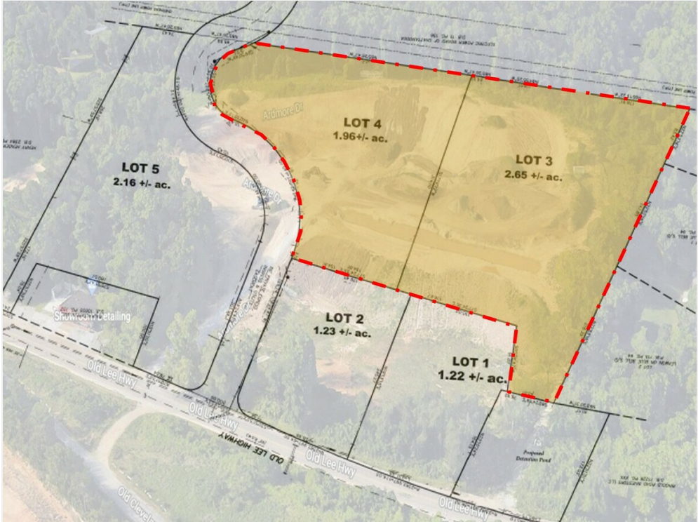
LOT 3 & 4 _ Outline - Inlay over Aerial