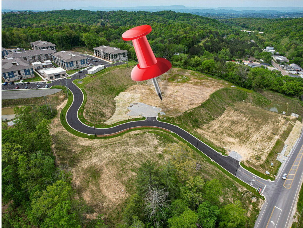
LOT 3 & 4 _ aerial 1