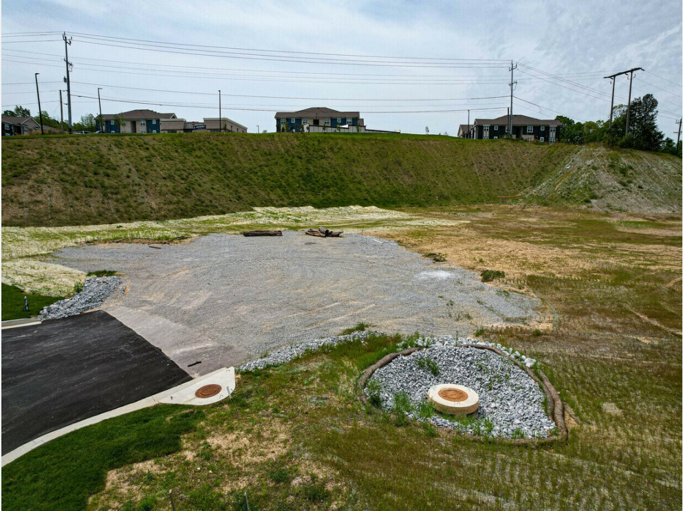
Lot 3 & 4 - Curb Cut_pic 1