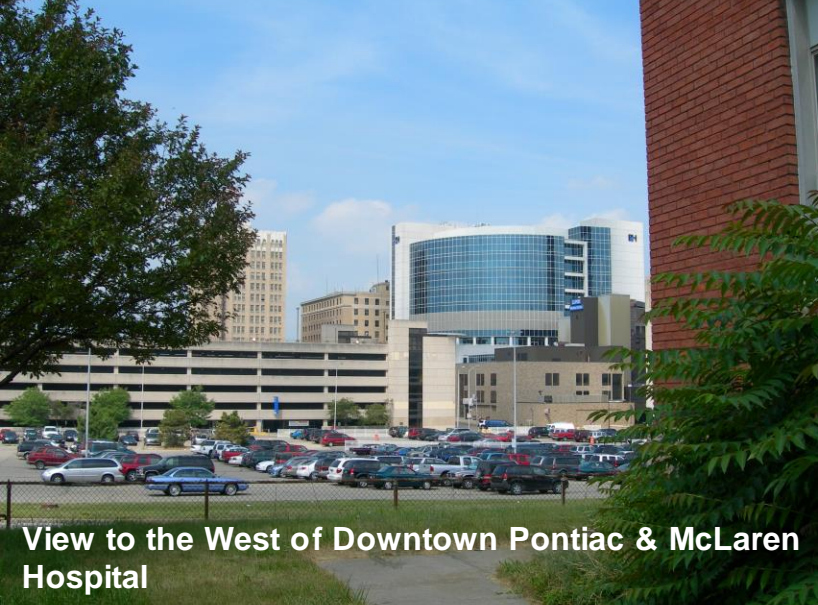
View to the West of Downtown Pontiac & McLaren Hospital