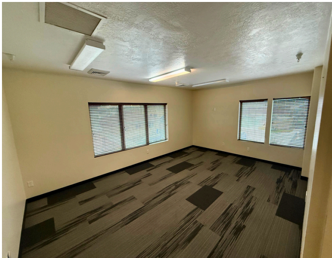
Suite 201: 1,500 SF

191 EAST FORT UNION BLVD., MIDVALE, UTAH 84047