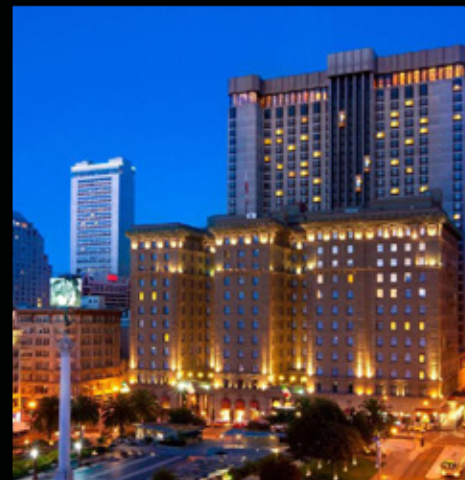
THE WESTIN ST. FRANCIS