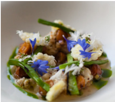
SONS AND DAUGHTERS