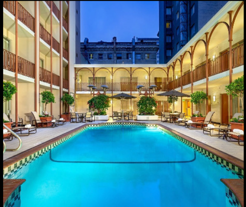
HANDLERY UNION SQUARE HOTEL