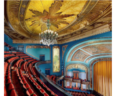
THE CURRAN THEATRE