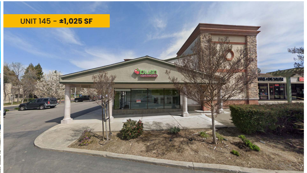
UNIT 145 - ±1,025 SF