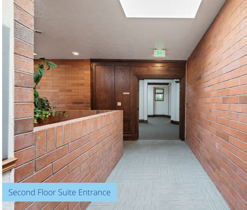
Second Floor Suite Entrance

This suite features classic brick walls, high-quality trimwork, and detailed craftsmanship, providing a solid foundation for any business. With some creative vision in paint and flooring, this space can be transformed into a modern, stylish office that reflects your unique brand and aesthetic.