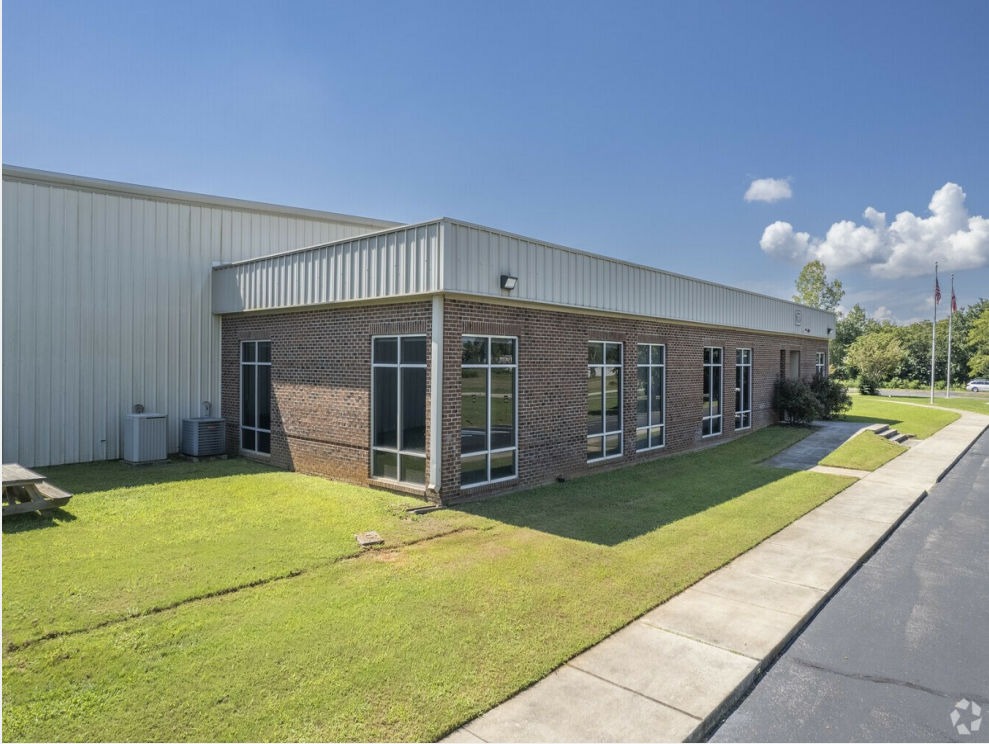
65 Shields Road