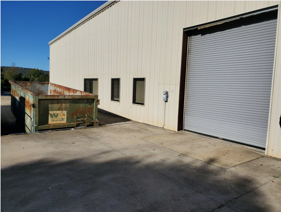
bay area 2