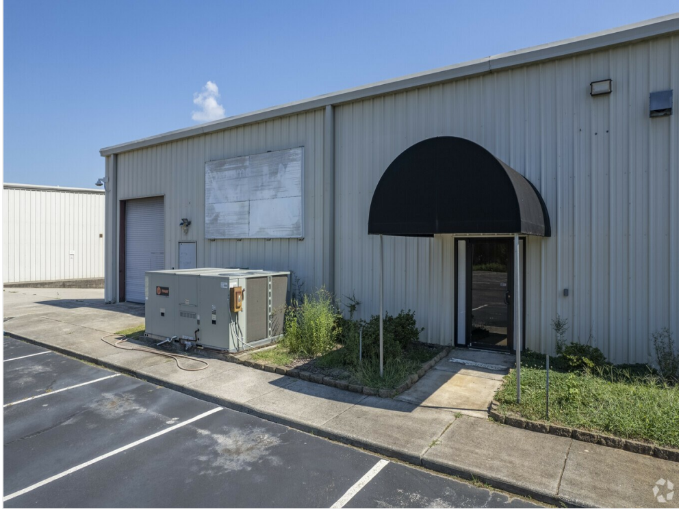
Entrance and Door-step Parking