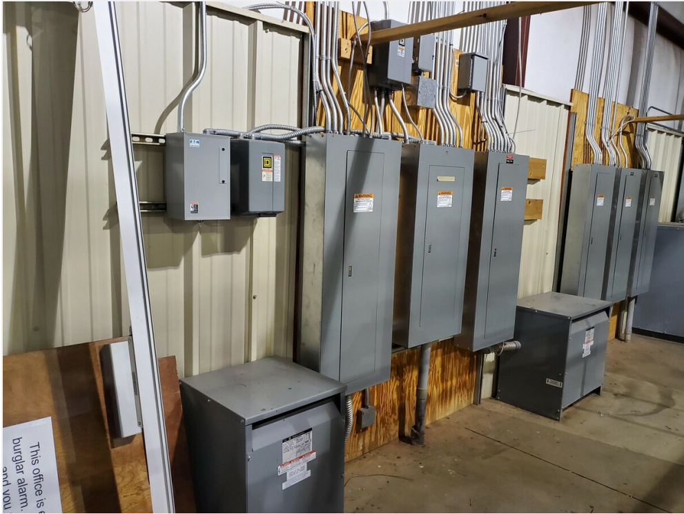
elec boxes 2