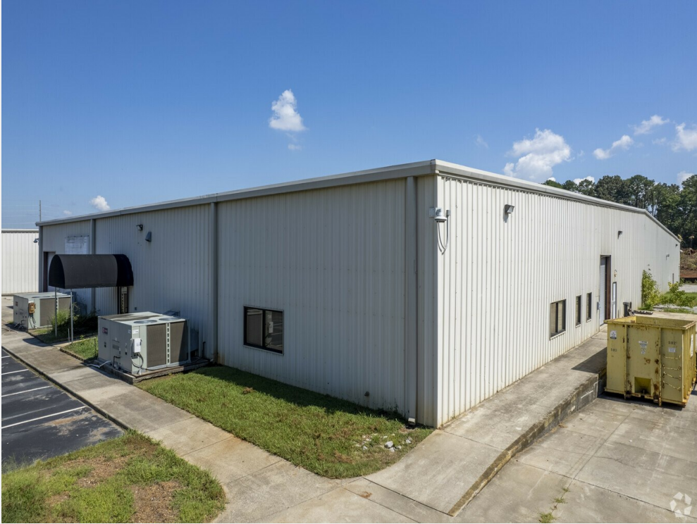
65 Shields Road