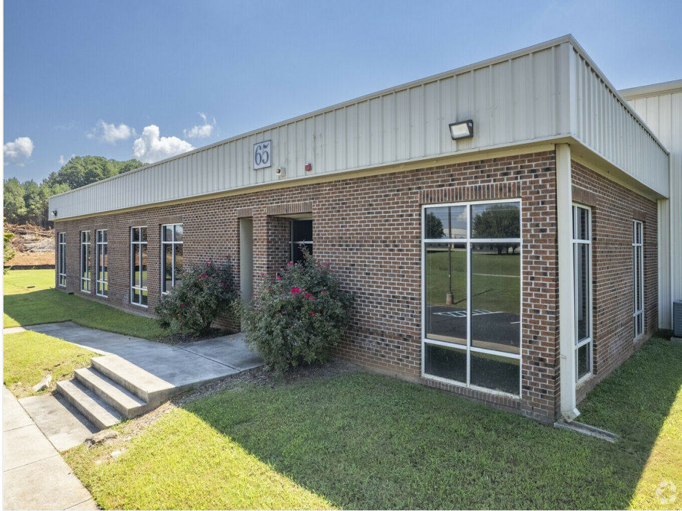
65 Shields Road