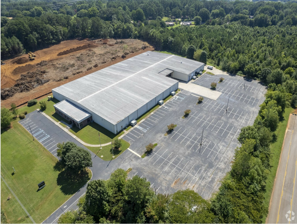
Situated in a Growing Metro