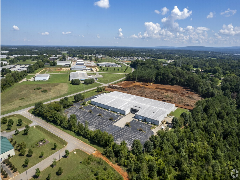
65 Shields Road Context