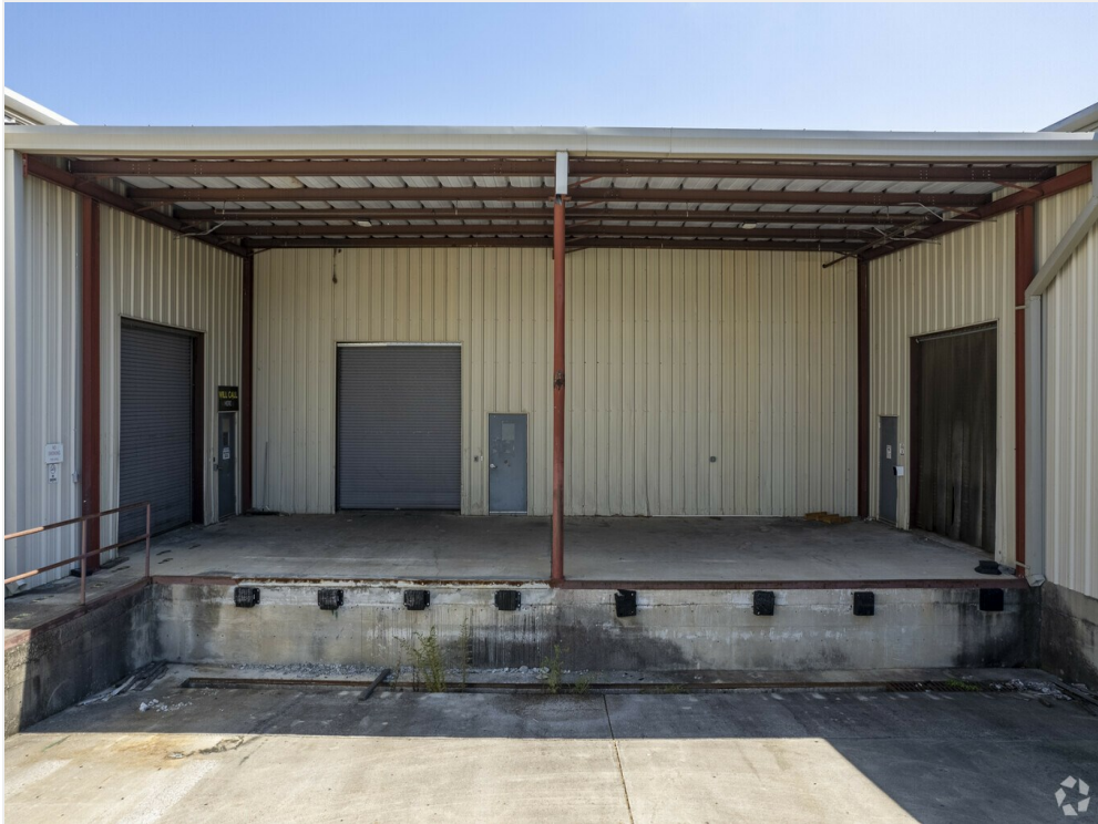
65 Shields Road Loading Area