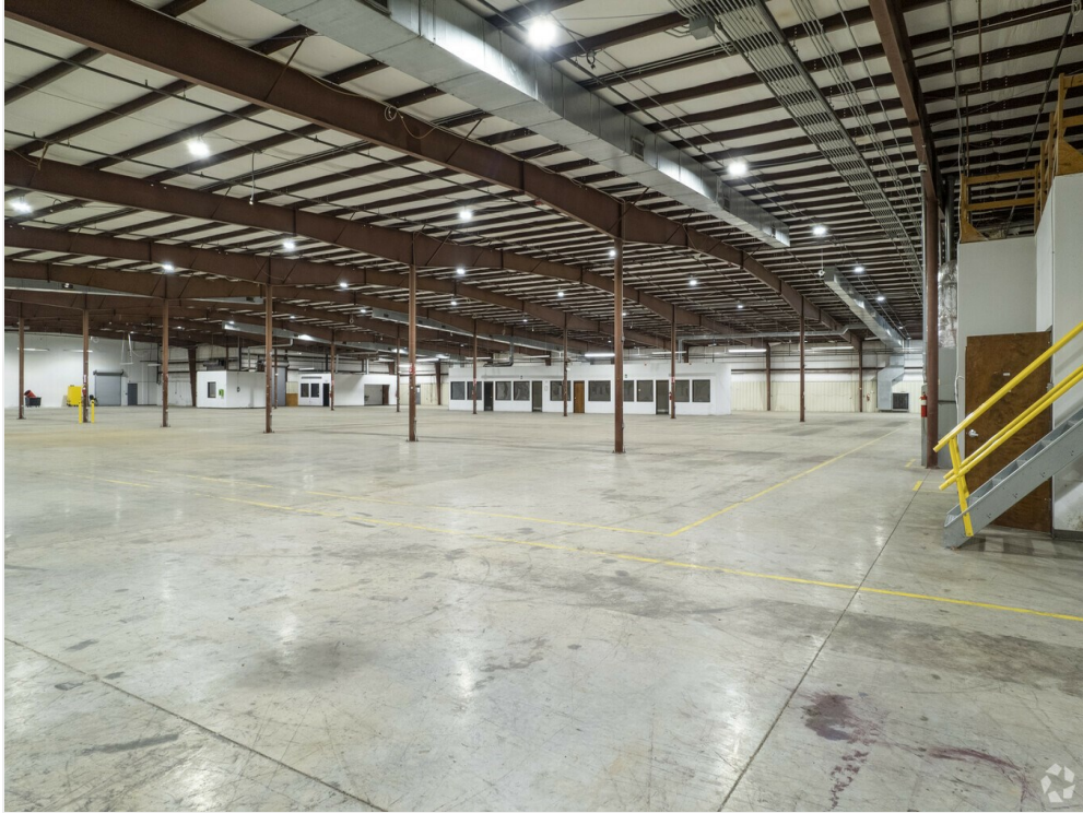
Warehouse 3D Tour