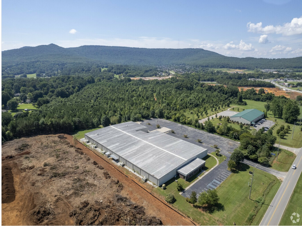
Situated in a Growing Metro