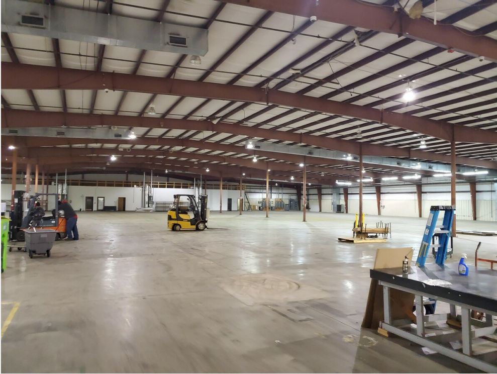
interior warehouse 3