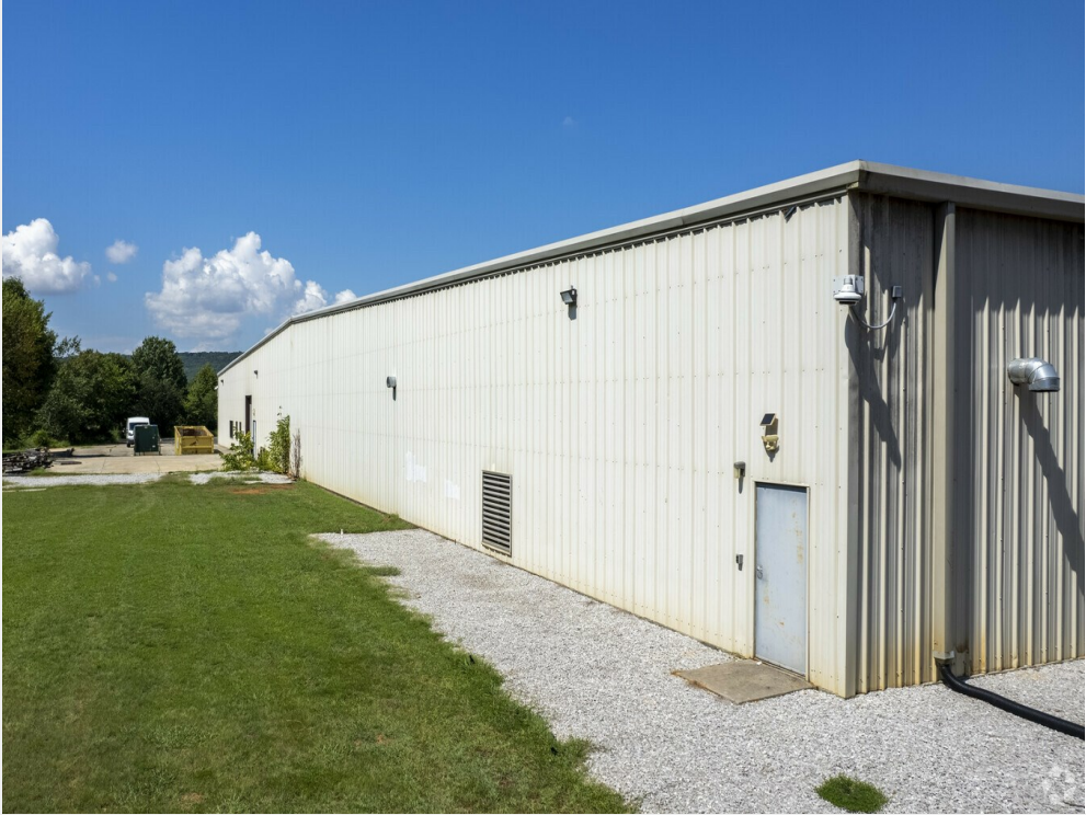
65 Shields Road Back Entrance