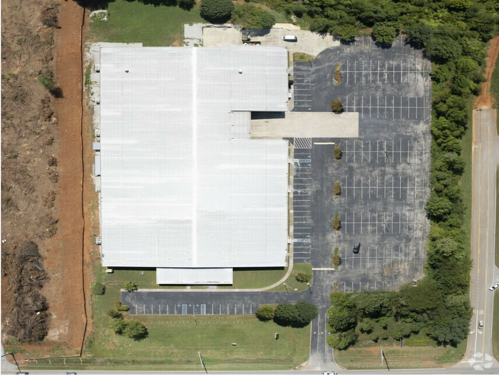
65 Shields Road Bird's Eye View