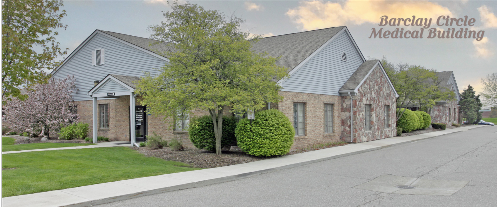
Barclay Circle Medical Building