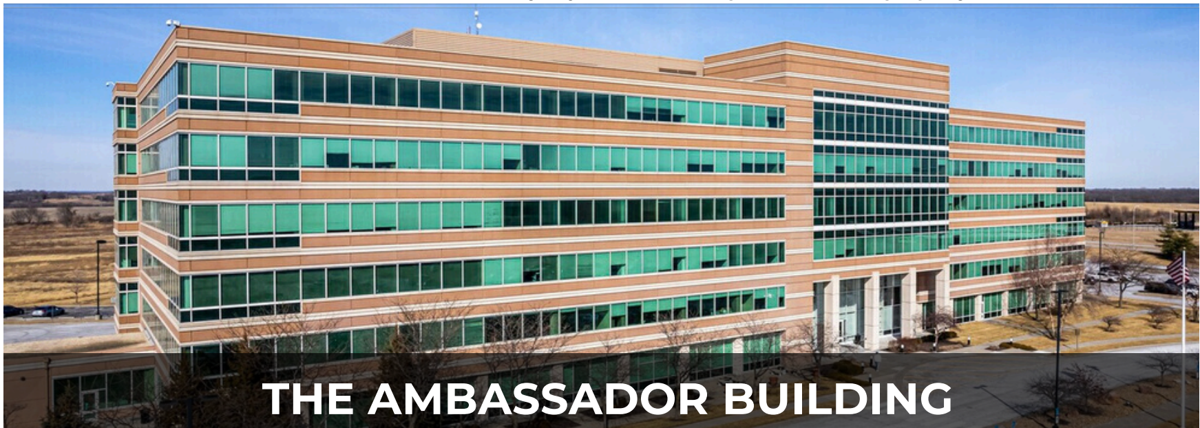
THE AMBASSADOR BUILDING

The Ambassador Building boasts ample, free surface parking surrounded by attractive water features, all conveniently located adjacent to Interstates 29 & 435. Call today to join final lease-up of this Class A property!