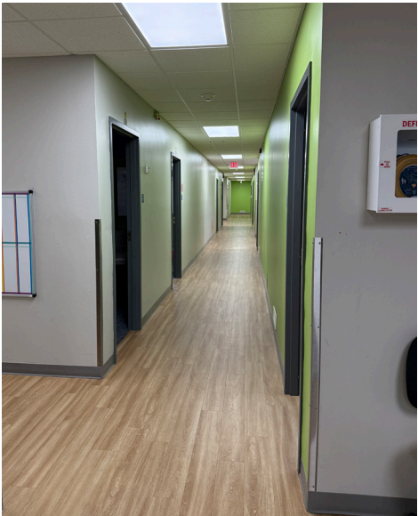
4610 W COMMERCIAL DRIVE, STE. A-D NORTH LITTLE ROCK, AR 72116