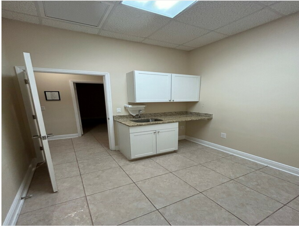
108_Exam Room 5