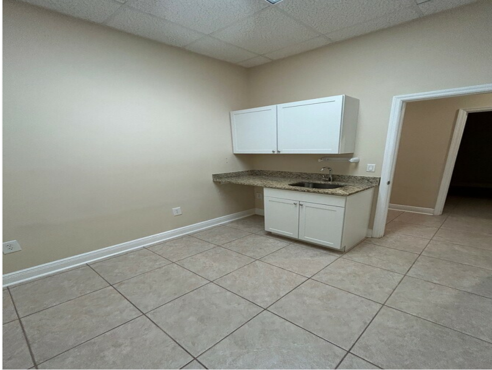
108_Exam Room 3