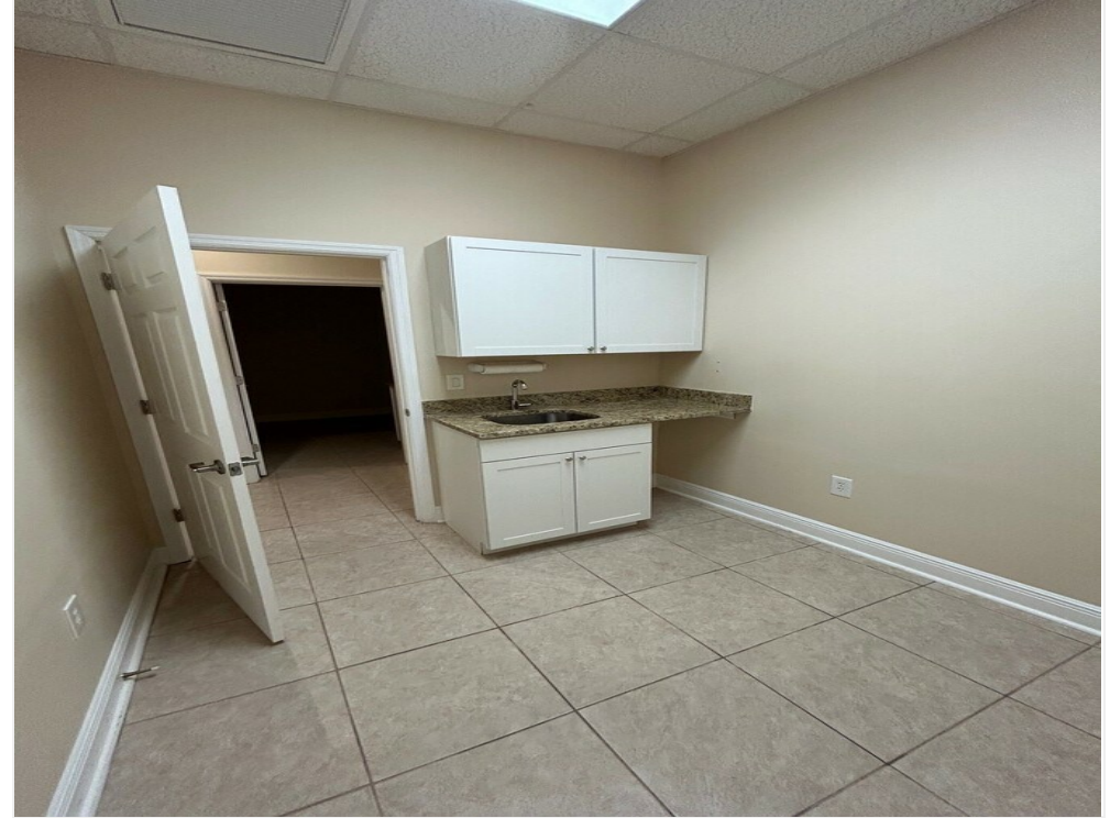
108_Exam Room 2