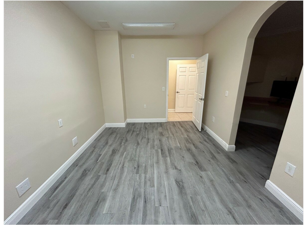
108_File Room 2