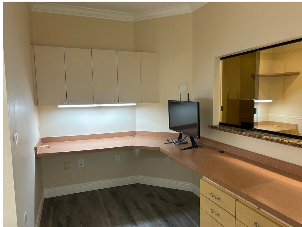
108_Reception Desk 2