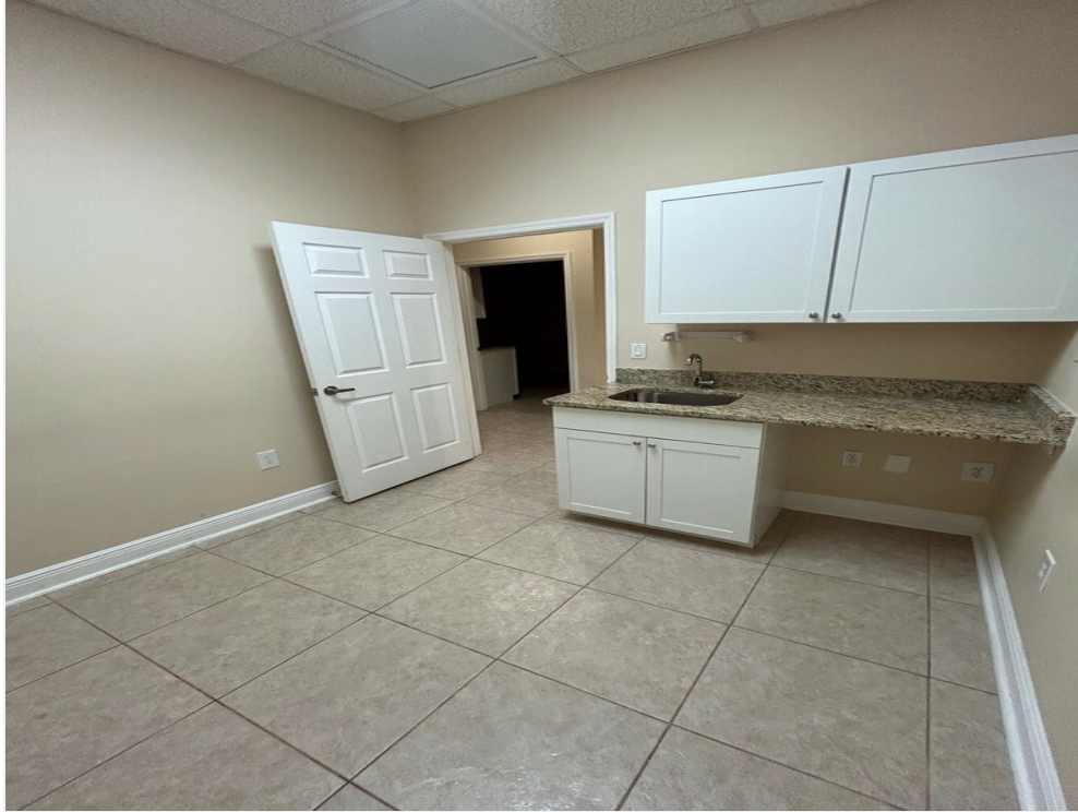
108_Exam Room 1