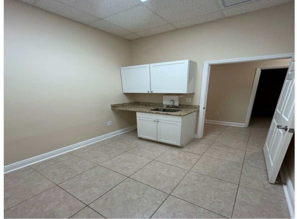
108 Exam Room 4