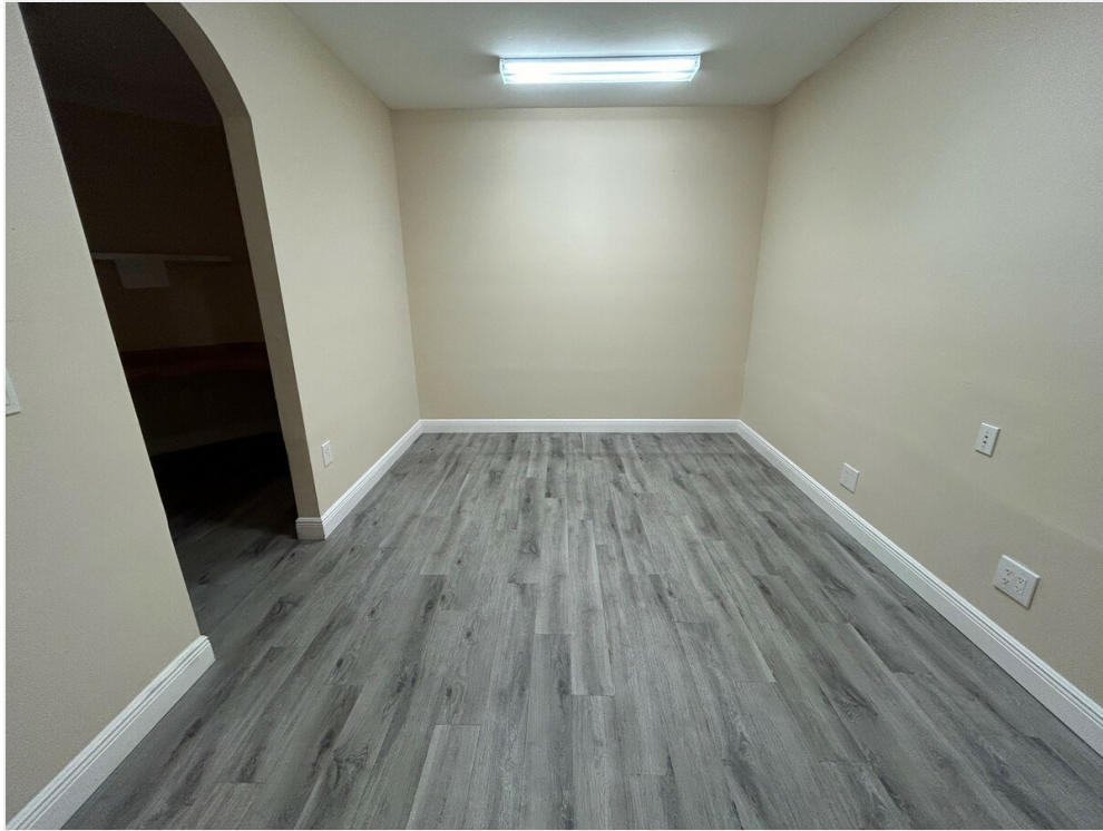
108_File Room 3