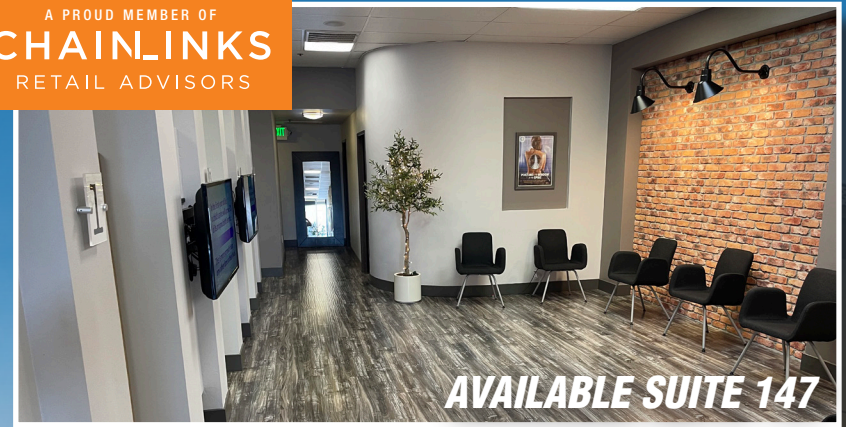
AVAILABLE SUITE 147

A PROUD MEMBER OF CHAINLINKS RETAIL ADVISORS