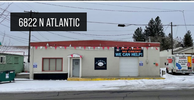
6822 N ATLANTIC