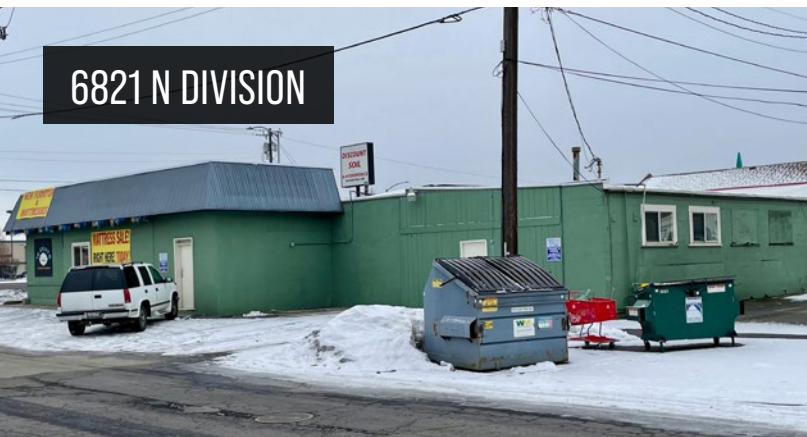
6821 N DIVISION