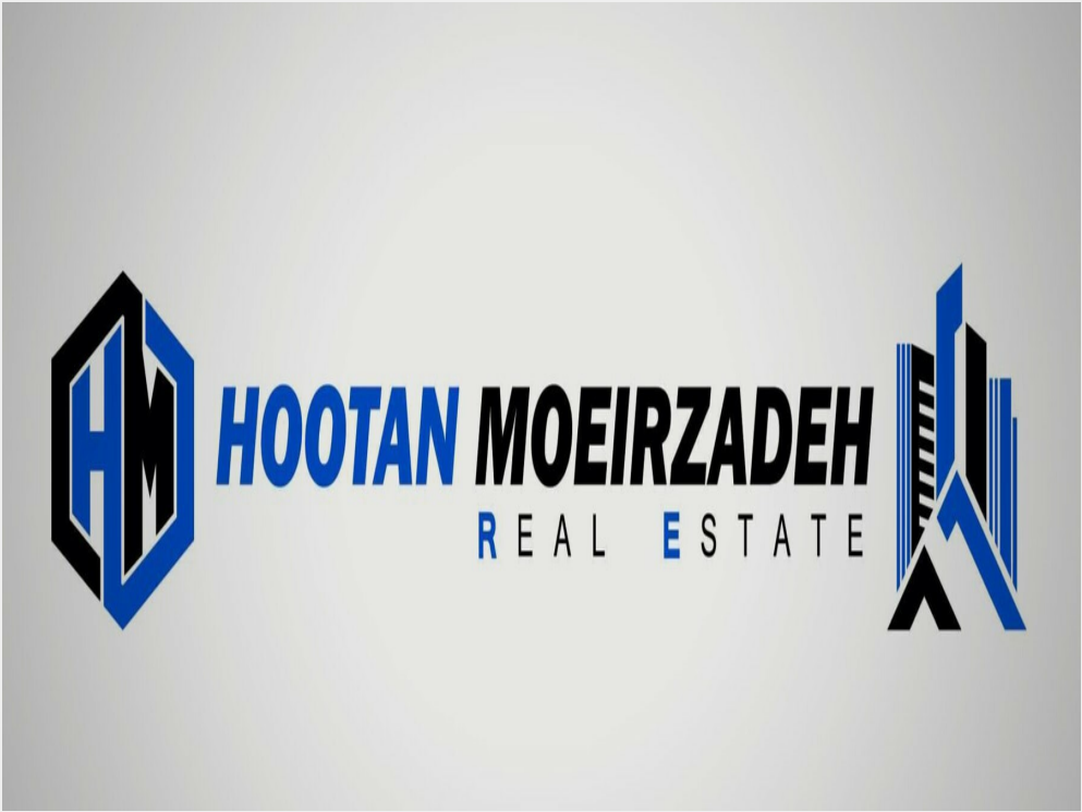
HootanRE Vint HighRes