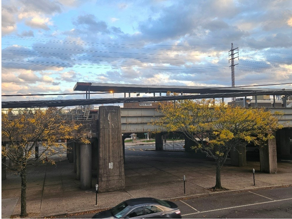
Lirr across the Street!