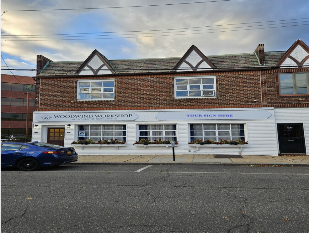
Front Your sign HERE