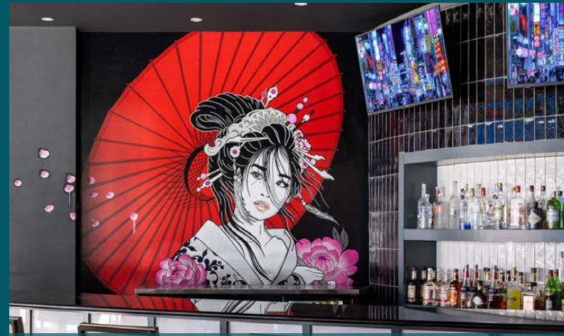
Yoki Restaurant & Sushi Bar