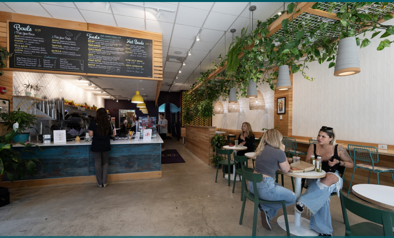
Liv's Juice Bar