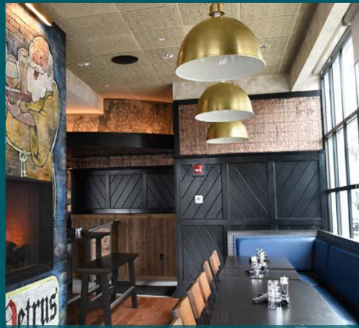
LongCross Bar & Kitchen