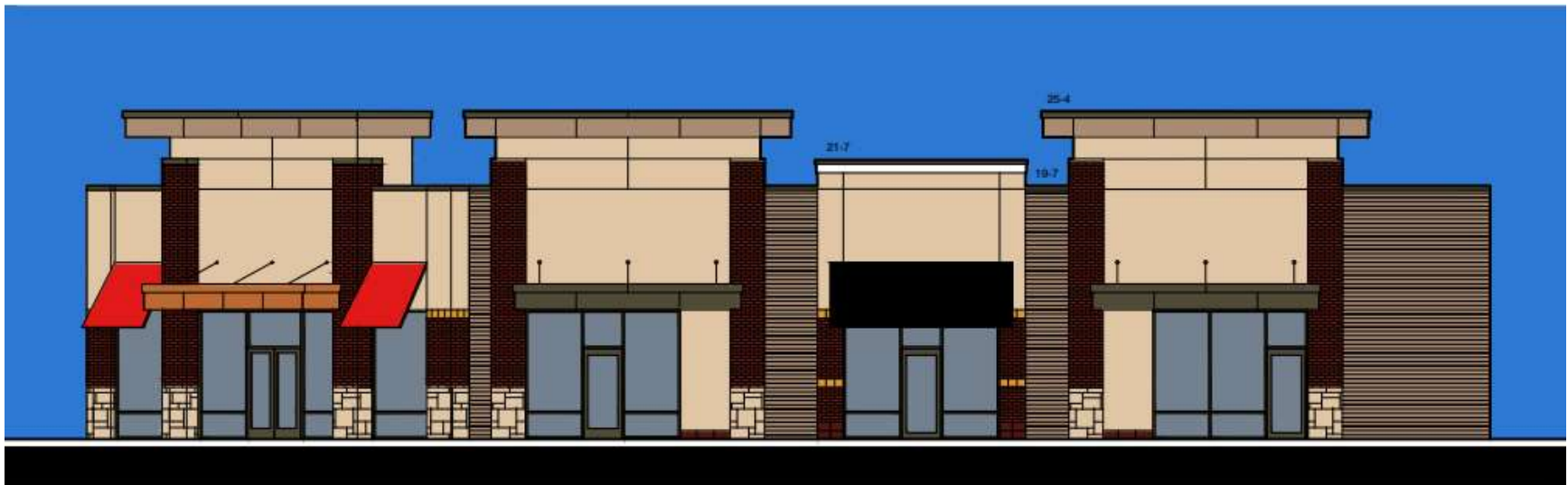
Building D – East View