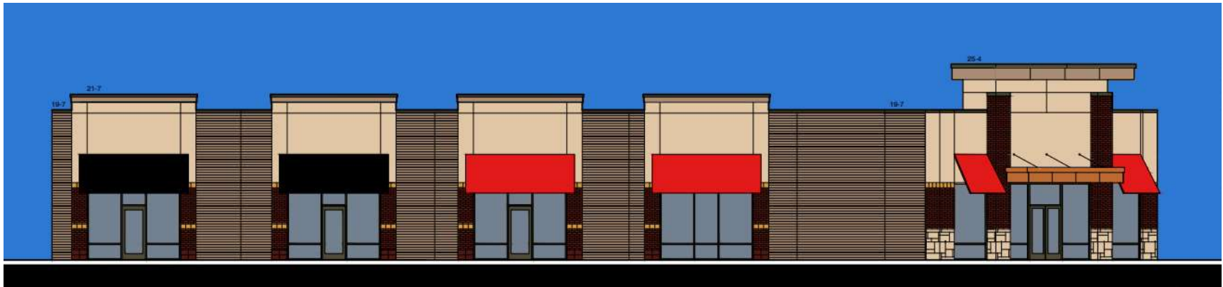
Building D – South View