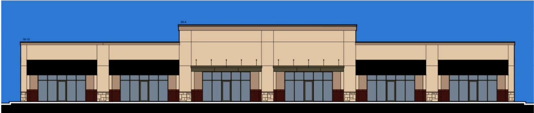
Building E – East View