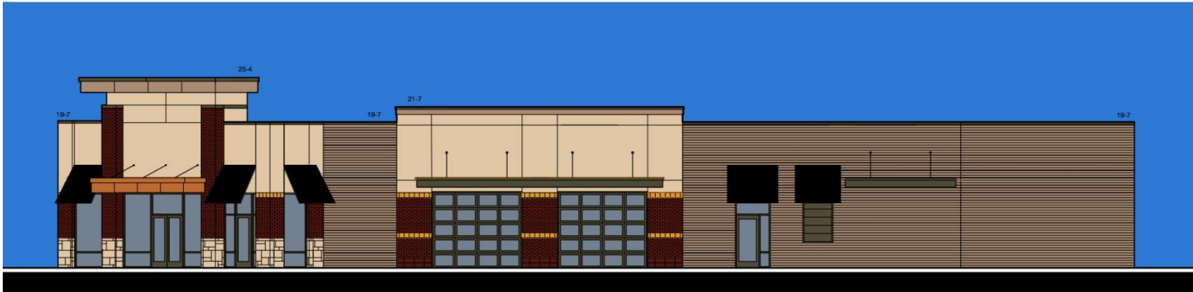
Building C – North View