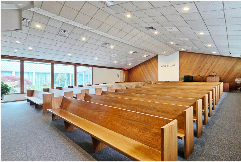
Auditorium / Sanctuary