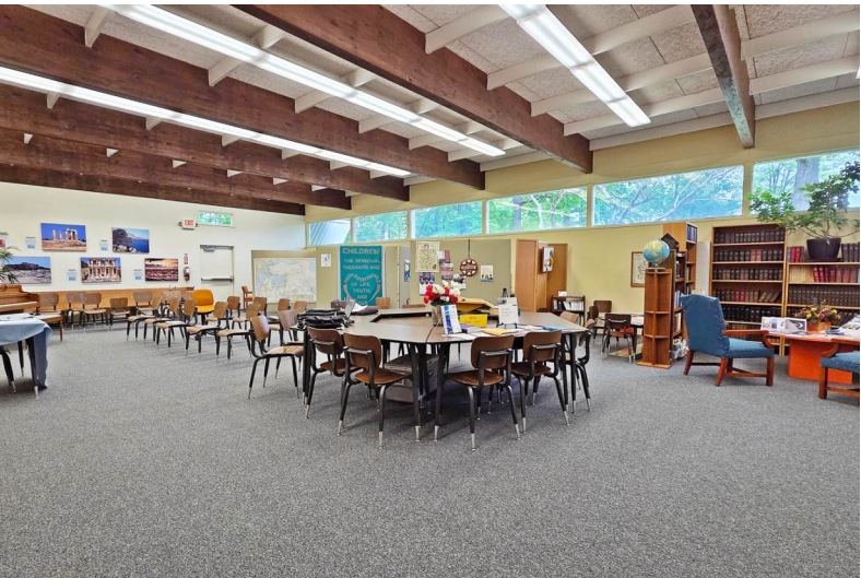
Multi-Purpose Room / Sunday School Room