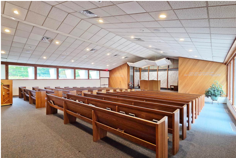
Auditorium / Sanctuary