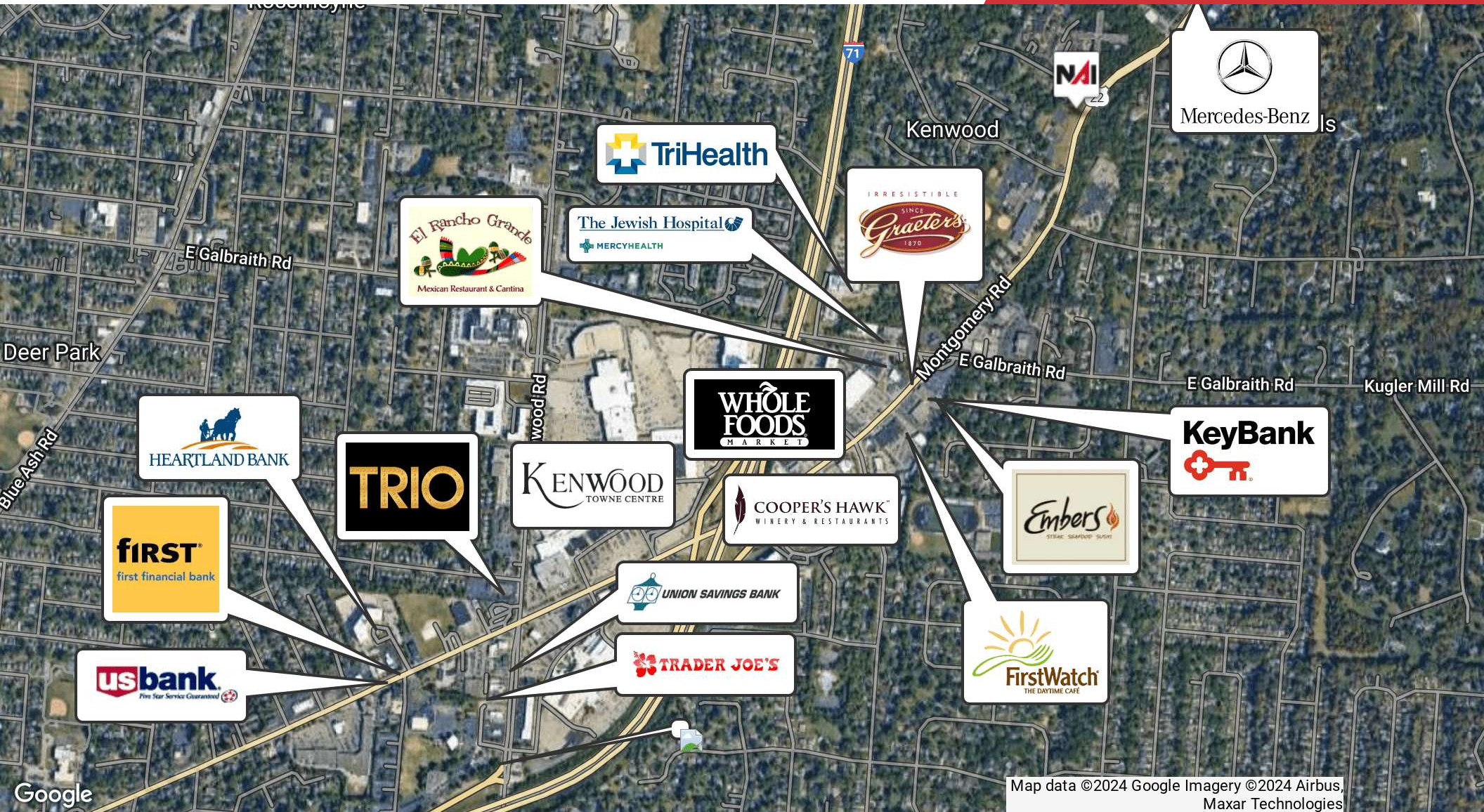
Map data ©2024 Google Imagery ©2024 Airbus, Maxar Technologies