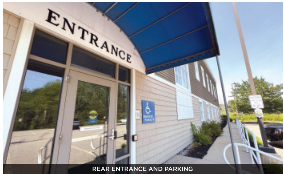
REAR ENTRANCE AND PARKING

P.O. Box 7432 Portland ME 04112-7432 • 207.653.6702 • www.roxanecole.com