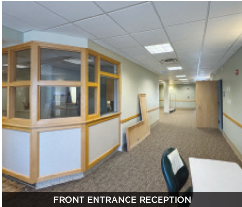
FRONT ENTRANCE RECEPTION