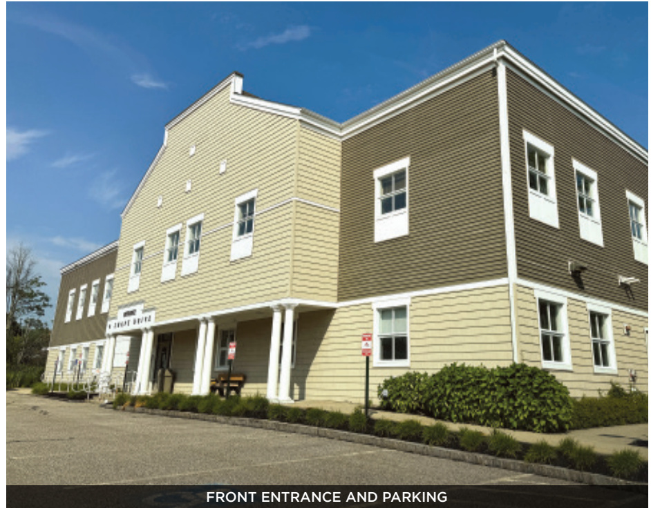
FRONT ENTRANCE AND PARKING