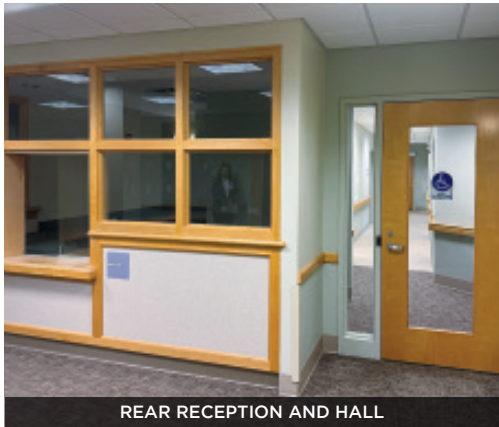
REAR RECEPTION AND HALL