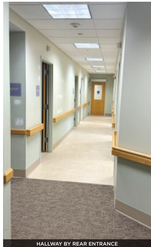
HALLWAY BY REAR ENTRANCE