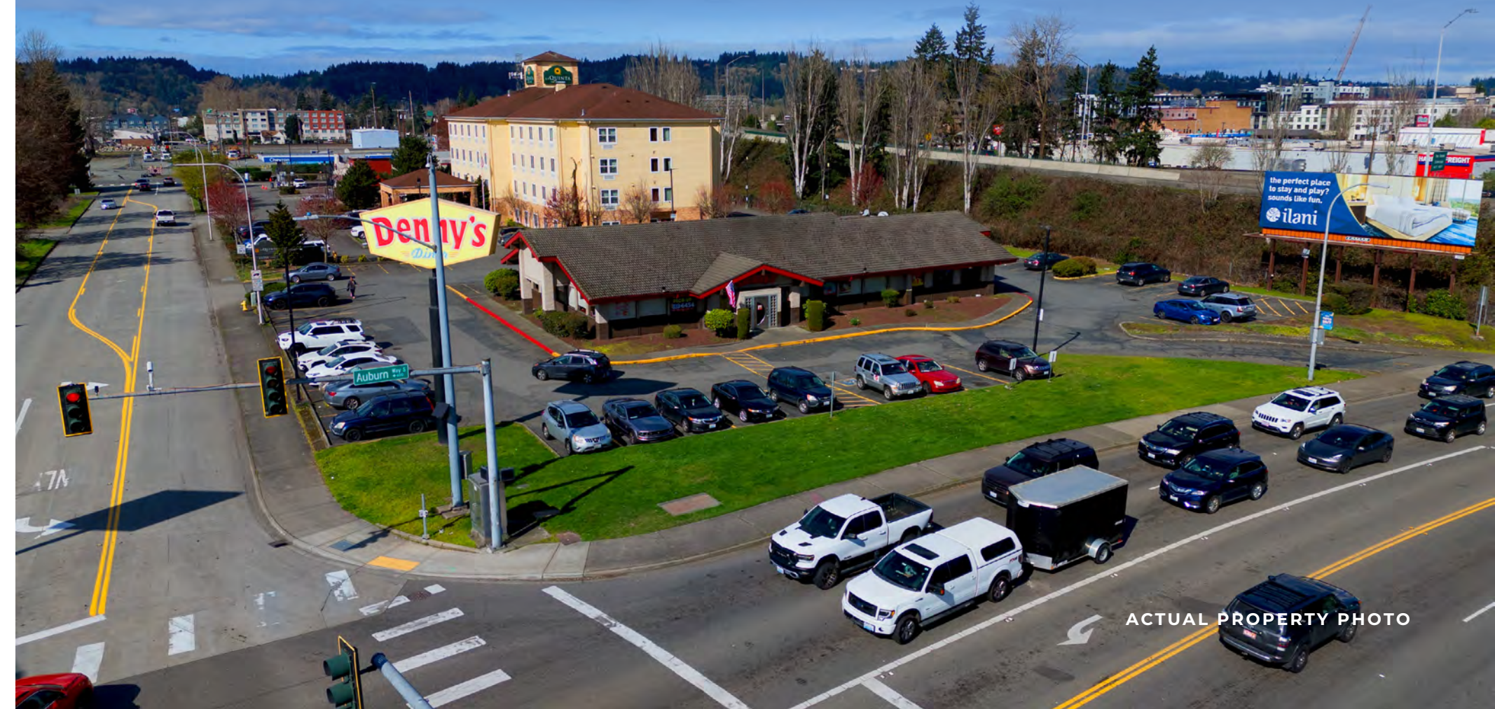
ACTUAL PROPERTY PHOTO