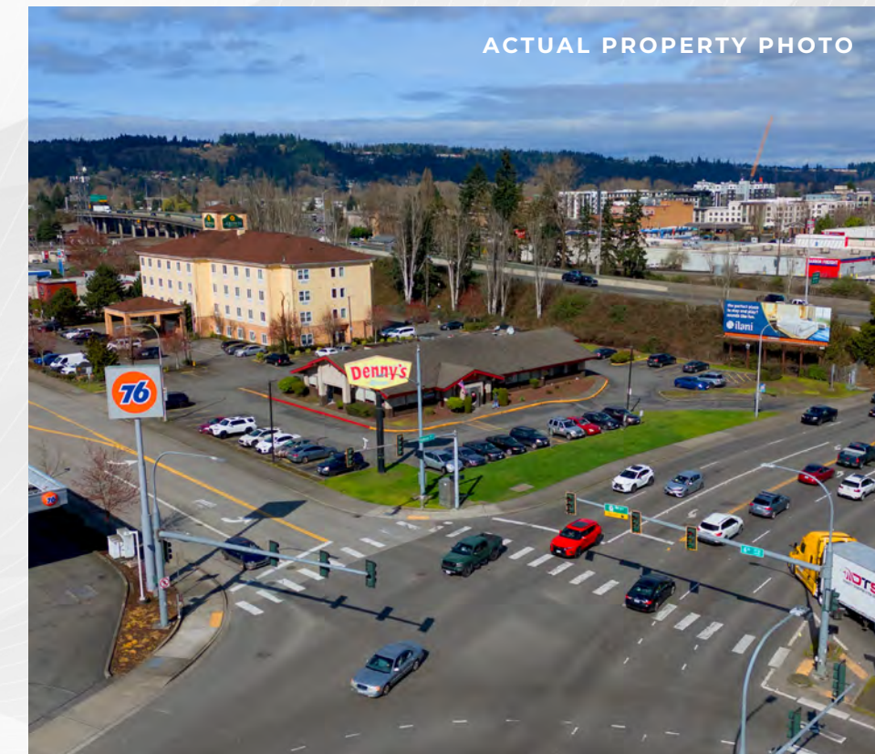
ACTUAL PROPERTY PHOTO