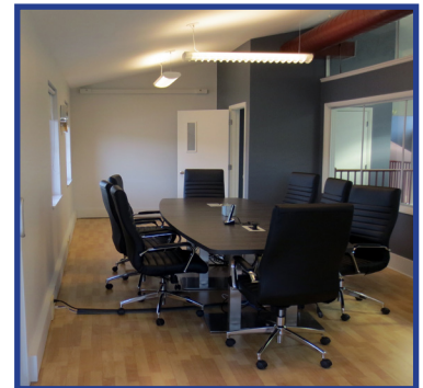
Conference Room & Patio