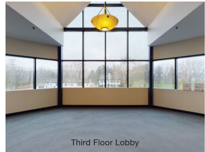
Third Floor Lobby