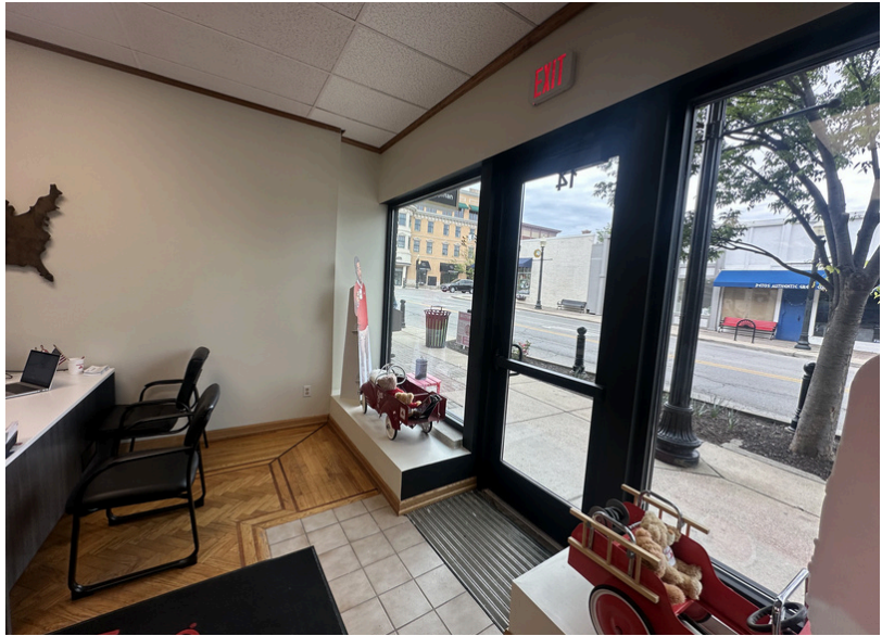
14 W Main Street, Carmel