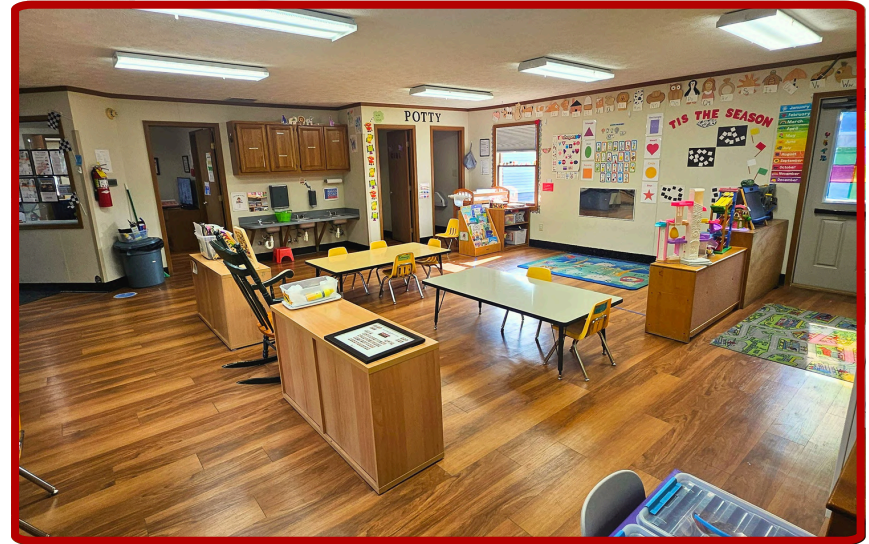
Spacious Layout with Dedicated Learning Zones