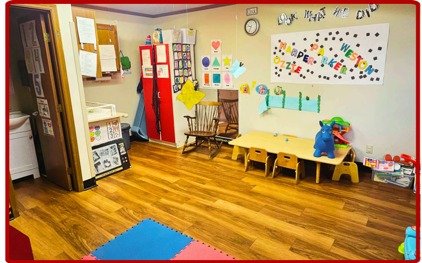
Turnkey Interior Furnished & Ready to Operate